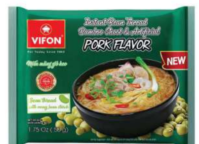
MG06 Bamboo Pork Flavor (50 g) Saveur de porc au bambou (50 g)