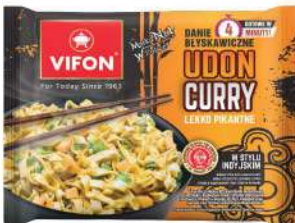
MRG03 Udon Curry (90 g)