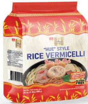
Rice Vermicelli "Bun Bo Hue" (908 g)