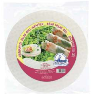
Vietnamese Salad Roll Wrapper 25cm (340 g)