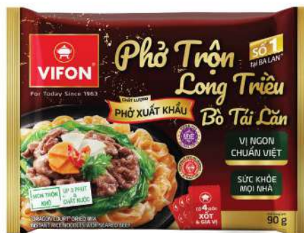
LTP03 Wok-seared Beef Flavor (90 g)