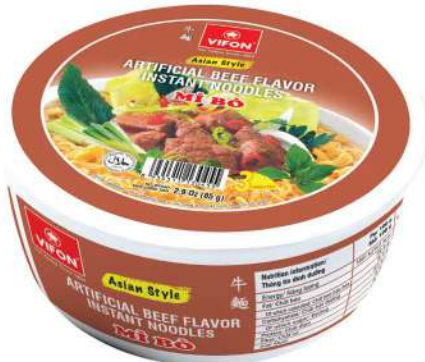
MIT01 Beef Flavor (85 g)