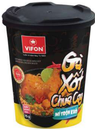
MKL02 Hot And Sour Chicken Sauce (75 g)