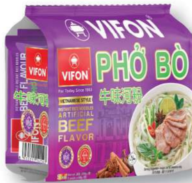
PHL01 Beef Flavor In Block (60 g X4)