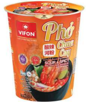
PHL03 Sour & Spicy Flavor (60 g)