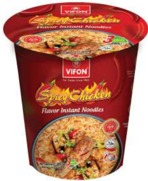
MCL01 Spicy Chicken Flavor (60 g)