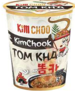
TKO02 Tomkha flavor (67 g)