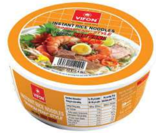
HTT04 "Phnom Penh" Style (70 g)