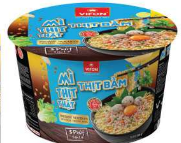
Instant Rice Noodles With Real Minced Pork (90 g)