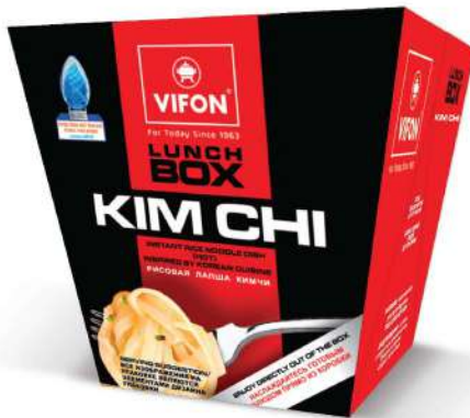
PHH02 Kimchi Flavor (85 g) Saveur de Kim Chi (85 g)