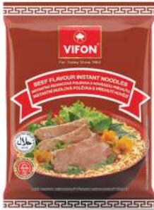
MIG07 Beef Flavor (60 g)