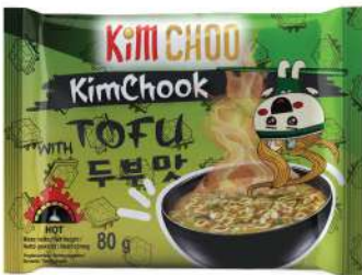
KCO05 Hot Tofu flavor (80 g)