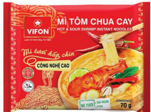
MTG02 Hot & Sour Shrimp (70 g)