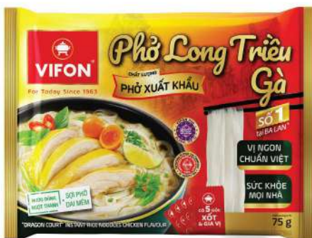
LTP02 Chicken Flavor (75 g)