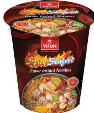
MCL02 Spicy Seafood Flavor (60 g)