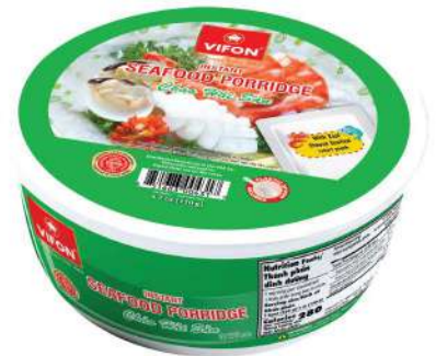
CHT02 Real Seafood (120 g)