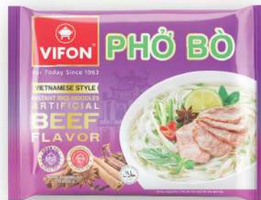
PHG01 Beef Flavor (60 g)