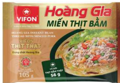
HGG04 Instant Bean Thread With Minced Pork (105 g)