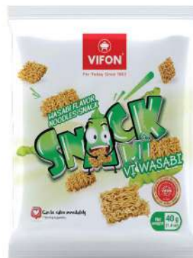
MSG04 Wasabi Flavor (40 g)