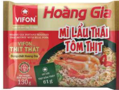
HGM05 Thai Hotpot With Real Pork (130 g)