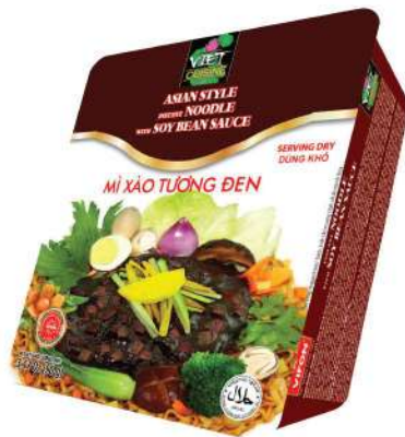
MIK01 Asian Style Instant Noodle With Soy Bean Sauce (90 g)