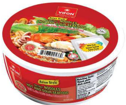
MIT07 Real Hot And Sour Seafood (120 g)