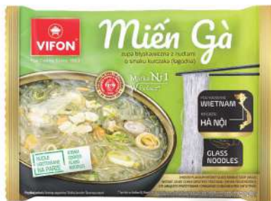
MG07 Chicken Flavor (58 g) Saveur de poulet (58 g)