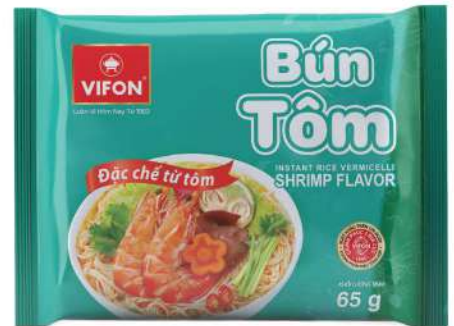
BUG03 Shrimp Flavor (65 g) Saveur de crevette (65 g)