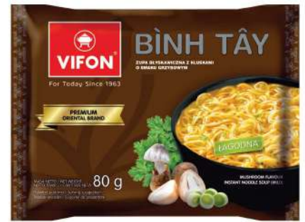
MIG03 Binh Tay Mushroom Flavour (80 g)