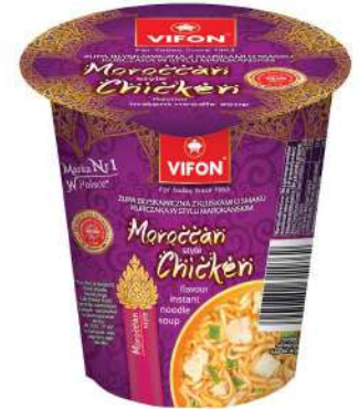
MIL10 Moroccan Style Chicken Flavor (60 g)