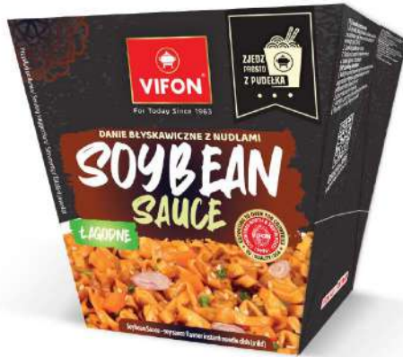
LBM01 Soybean Sauce Flavour (85 g)