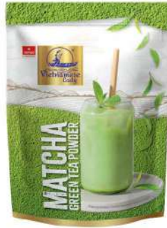
MATCHA GREEN TEA POWDER (50 g)