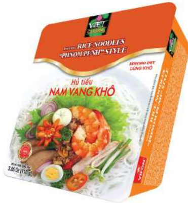
HKT01 Asian Style Instant Rice Noodle "PHNOM PENH" Style (110 g)