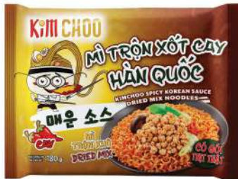
Spicy Korean Sauce (180 g)