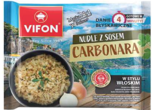
MTG002 Carbonara - Italian Style Flavor in Dish (97 g)