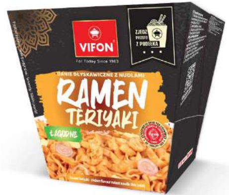
LBM02 Ramen Teriyaki Flavor (85 g)