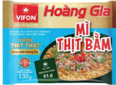
HGM02 Minced Pork (130 g)