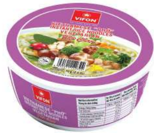
PHT03 Vegetarian (70 g)