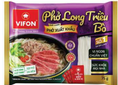
LTP01 Beef Flavor (75 g)