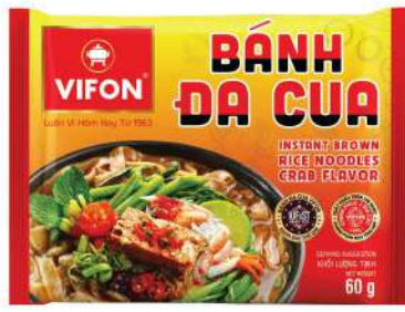
BDG03 Crab Flavor (60 g)