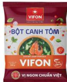
MUG03/ 04 High - Quality Iodine Salt (450 g/ 950 g)