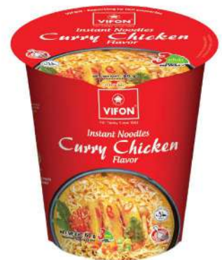
MIL06 Curry Chicken Flavor (60 g)