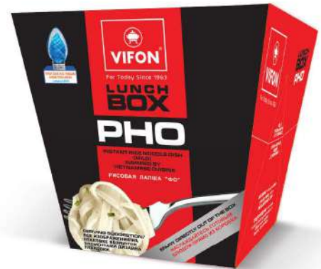
PHH01 Pho Flavor (85 g) Saveur Pho (85 g)