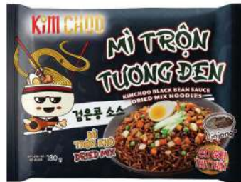
Black Bean Sauce (180 g)