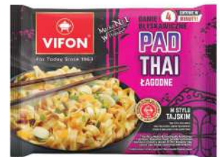
MRG05 Pad Thai Flavor (90 g)