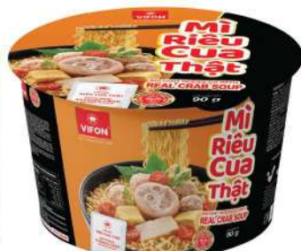
Instant Noodles With Real Crab Soup (90 g)