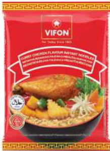
MIG11 Curry Chicken Flavor (60 g/ 70 g)