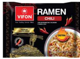
MRG02 Ramen Chili Flavor (80 g)