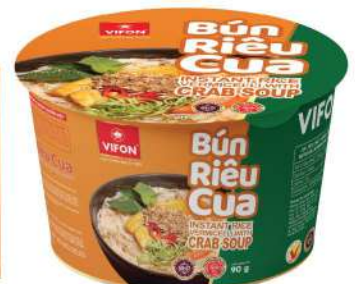
Instant Rice Vermicelli With Crab Soup (90 g)