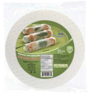
Vietnamese Fresh Spring Rolls 25cm (567 g)