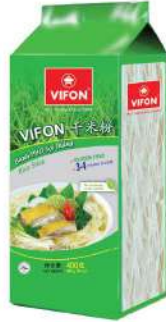
PHG08 Premium Rice Noodles (400 g)