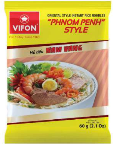
HTG01 "Phnom Penh" Style (60 g)