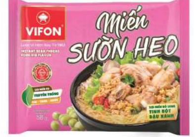
MG03 Pork Rib Flavor (58 g) Saveur de côtes de porc (58 g)