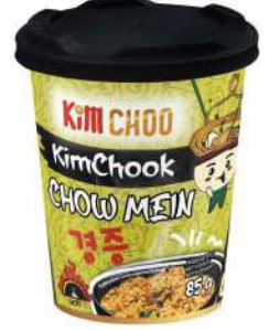
KCO05 Chow Mein Flavor (85 g)