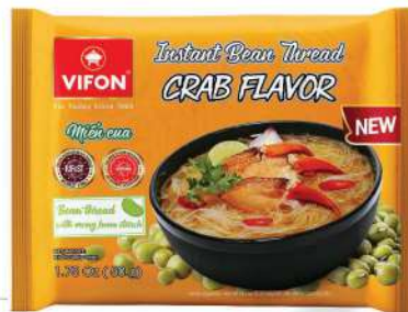
MG05 Crab Flavor (50 g) Saveur de crabe (50 g)