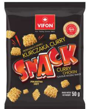
MSG05 Curry Chicken Flavor (50 g)