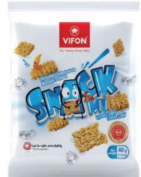
MSG03 Hot And Sour Seafood Flavor (40 g)