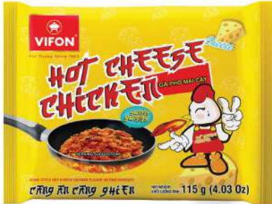
MCG01 Asian Style Hot Cheese Chicken Flavor (115 g)