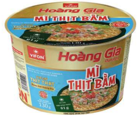
Instant Noodle With Minced Pork (130 g)