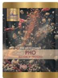
Pho Broth Powder (70 g)