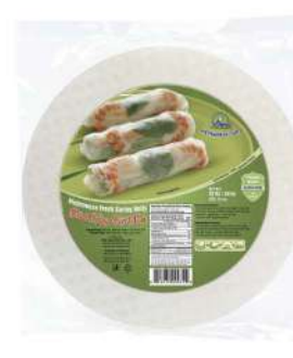
Vietnamese Fresh Spring Rolls 22cm (567 g)