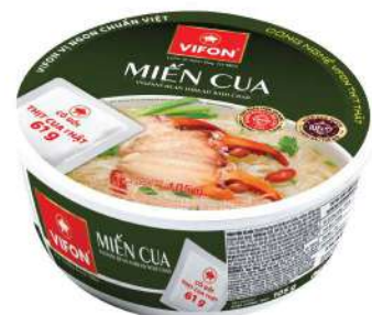
MT01 Real Crab (105 g) Vrai crabe (105 g)