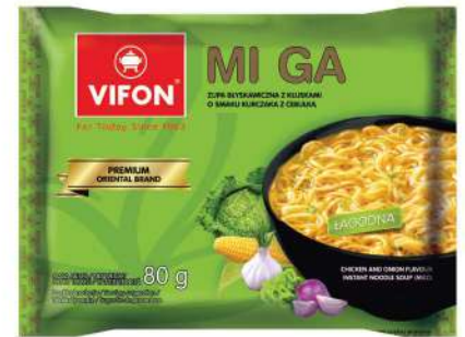
MIG06 Chicken And Onion Flavor (80 g)