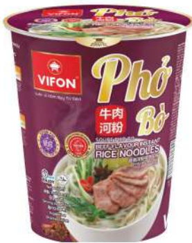
PHL01 Beef Flavor (60 g)