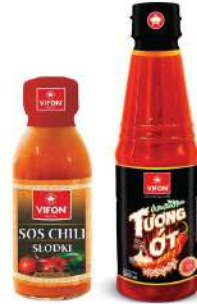
TON01/02 Sweet Chilli Sauce (100 ml/ 230 ml)