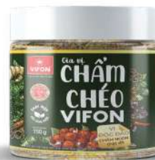
BCG03 Shrimp Soup Powder (10 g)