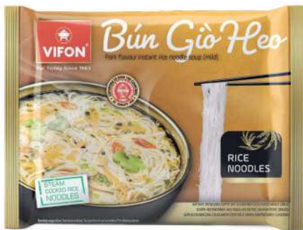
BUG04 Pork Flavor Soup (65 g) Soupe saveur de porc (65 g)