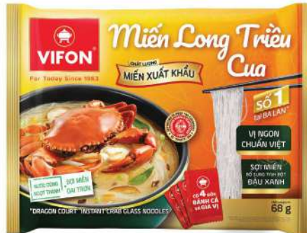
LTM02 Crab Flavor (68 g)