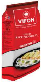
PHG04 Dried Rice Noodles (300 g)