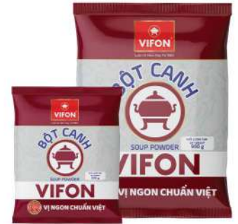
BCG01/ 02 14% Soup Powder (200 g/ 900 g)