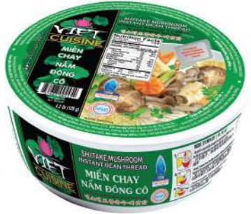
MNT01 Shiitake Mushroom Instant Bean Thread (120 g)