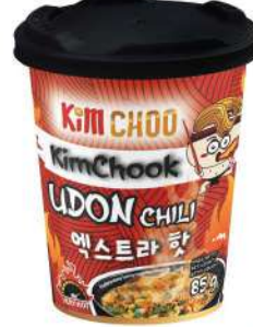
KCO04 Udon Chilli flavor (85 g)