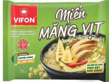
MG02 Duck & Bamboo Shoots Favor (58 g) Saveur de canard et de pousses de bambou (58 g)