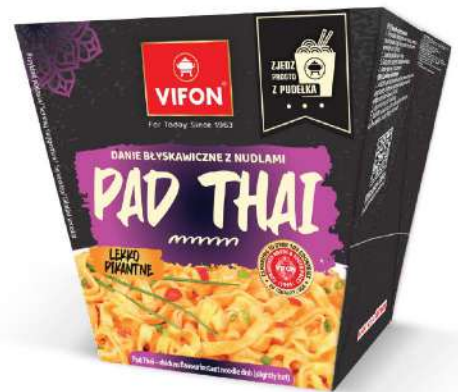
LBM03 Pad Thai Flavor (85 g)