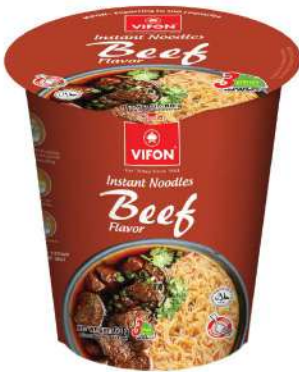
MIL01 Beef Flavor (60 g)