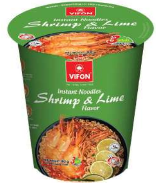
MIL03 Shrimp & Lime Flavor (60 g)