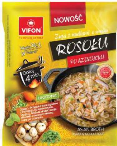
MNG03 Asian Broth Flavor (105 g)