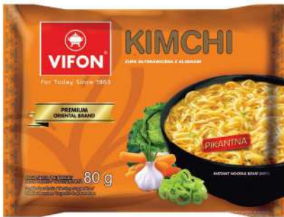
MIG04 Kimchi Flavor (80 g)