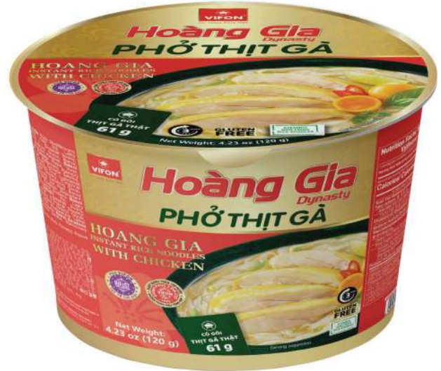
Instant Rice Noodles With Chicken (120 g)