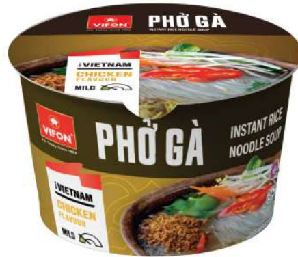
Chicken Flavor (70 g)