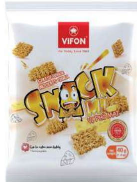
MSG02 Cheese Flavor (40 g)