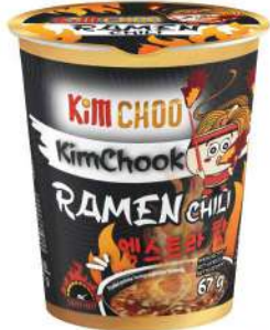
TKO01 Ramen Chilli (67 g)