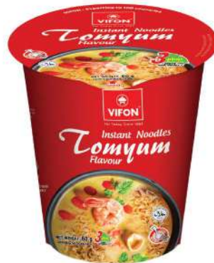
MIL05 Thai Tom Yum Flavor (60 g)