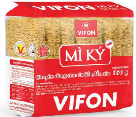
MIG49 Without Seasoning (950 g)