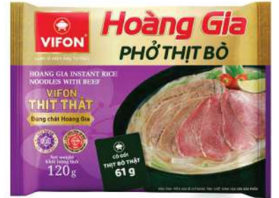
HGG01 Real Beef (120 g)