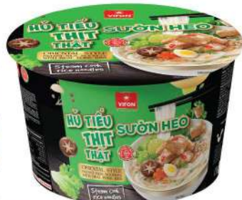
Instant Rice Noodles With Real Pork Ribs (90 g)