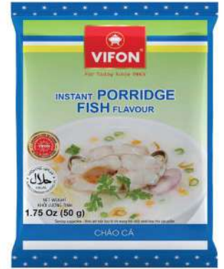
CHG03 Fish Flavor (50 g)