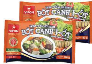
BCG04 Iodine Seasoning Powder (180 g)