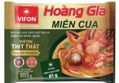
HGG03 Instant Bean Thread With Crab (105 g)