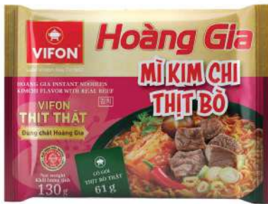
HGM04 Kimchi Flavor With Real Beef (130 g)