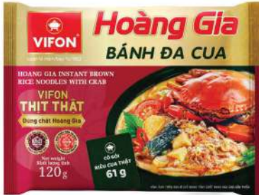
BDG01 Crab Flavor With Real Meat (120 g)