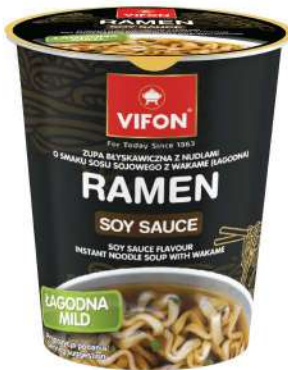
MRL01 Ramen Soy Sauce Flavor (60 g)