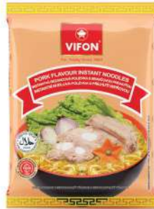
MIG12 Pork Flavor (60 g)