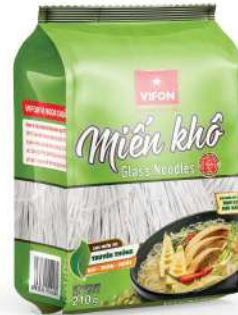
MKG01: Glass Noodle (210 g)