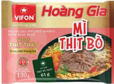
HGM01 Real Beef (130 g)