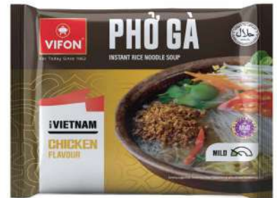
Chicken Flavor (60 g)