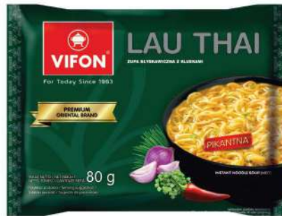
MIG05 Lauthai Flavor (80 g)