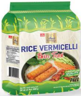
Rice Vermicelli "Bun Tươi" (908 g)