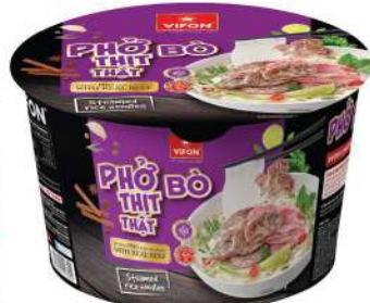
Instant Pho Rice Noodles With Real Beef (90 g)