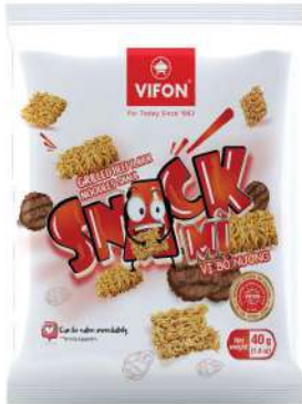
MSG01 Beef Flavor (40 g)