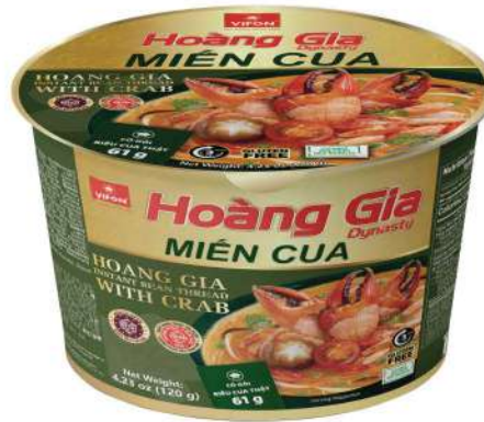
Instant Bean Thread With Crab (120 g)