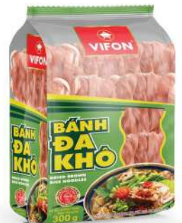
BDG02 Dried Brown Rice Noodles (300 g)