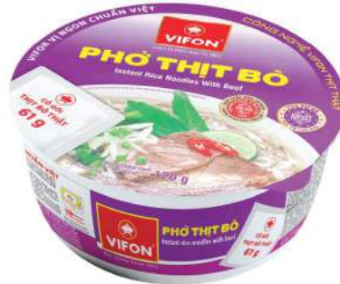
PHT04 Real Beef (120 g)