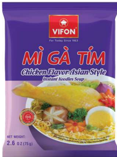
MIG05 Chicken Flavor (75 g)