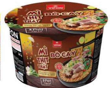
Instant Noodles With Real Beef (90 g)