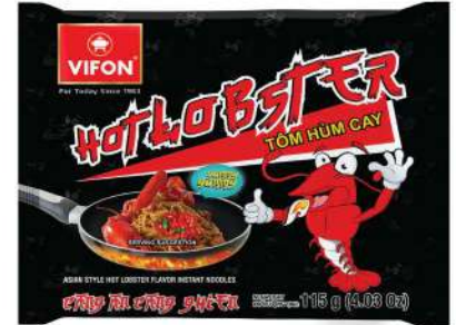
MCG03 Asian Style Hot Lobster Flavor (115 g)