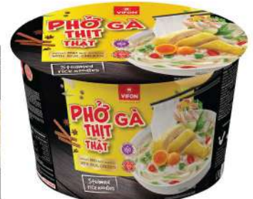
Instant Pho Rice Noodles With Real Chicken (90 g)