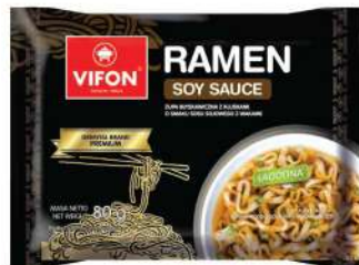
MRG01 Ramen Soy Sauce Flavor With Wakame (80 g)