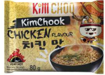
KCO08 Hot chicken flavor (80 g)