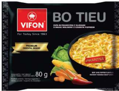
MIG01 Beef And Pepper Flavour (80 g)