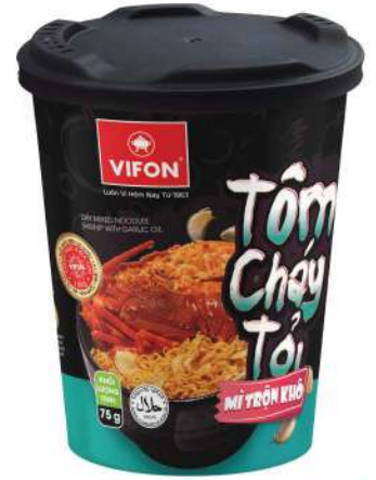
MKL04 Shrimp With Garlic Oil (75 g)