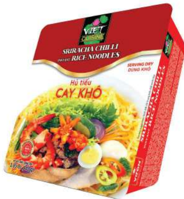
HKT02 Sriracha Chili Instant Rice Noodles (110 g)