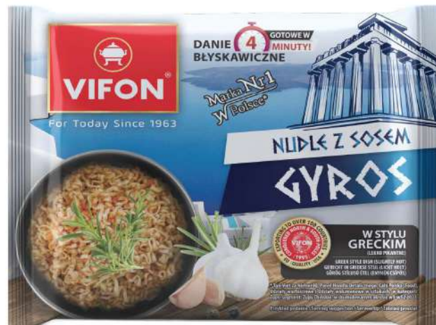
MTG03 Gyros chicken flavor in Dish (97 g)