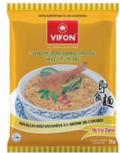
MIG15 Duck Flavour (70 g)