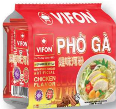
PHL02 Chicken Flavor In Block (60 g X 4)