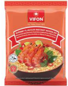
MIG09 Shrimp Flavor (60 g/ 70 g)