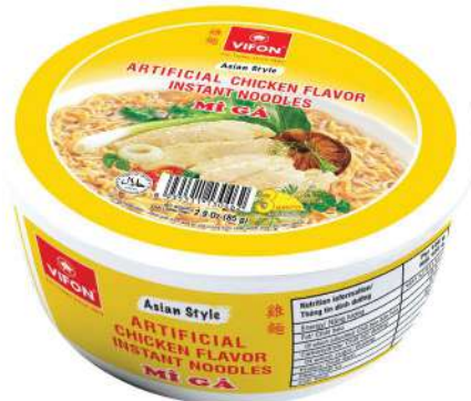
MIT02 Chicken Flavor (85 g)