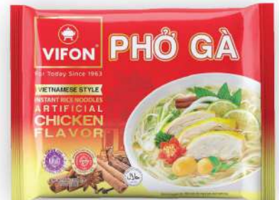
PHG02 Chicken Flavor (60 g)