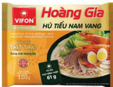
HGG05 "PHNOMPENH" Style With Real Meat (120 g)