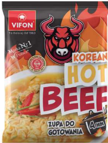
MNG01 Extra Spicy Beef Flavour (105 g)