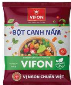
MUG01/ 02 High - Quality Salt (450 g/ 950 g)