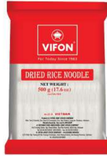
HTG05 Small Size 1mm (500 g)