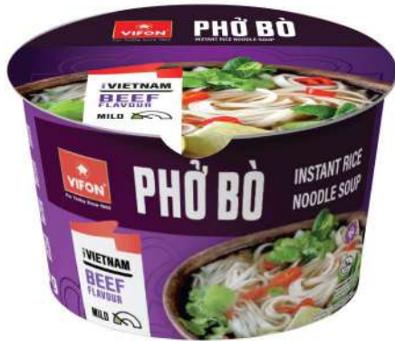
Beef Flavor (70 g)