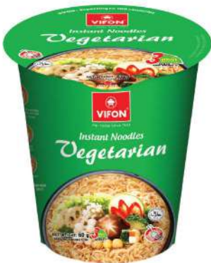
MIL07 Vegetarian (60 g)