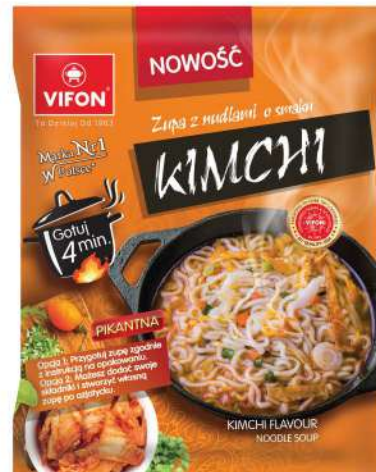
MNG04 Kimchi Flavor (105 g)