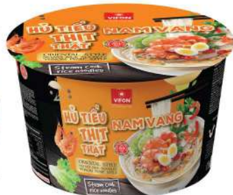
Instant Rice Noodles "Phnom Penh" Style (90 g)