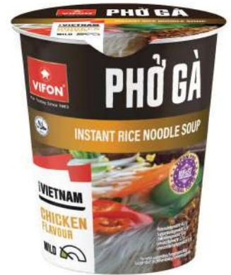
Chicken Flavor (60 g)