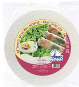
Vietnamese Salad Roll Wrapper 22cm (340 g)