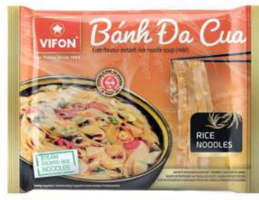
BDG05 Crab Flavor (60 g)