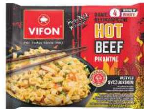
MRG08 Hot Beef Flavor (90 g)