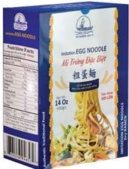
Imitation Egg Noodle 4mm (400 g)