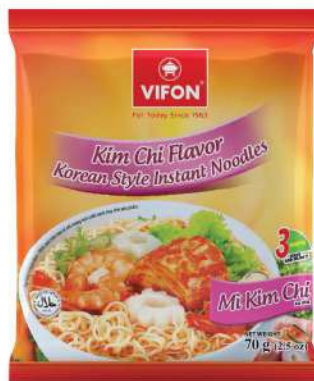
MIG23 KIMCHI FLAVOR KOREAN STYLE (70 g)