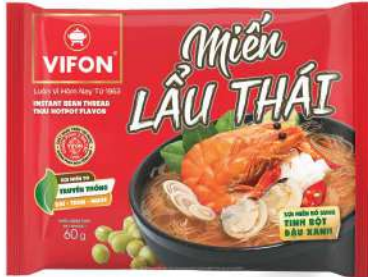
MG01 Thai Hotpot Flavor (60 g) Saveur de fondue Thaï (60 g)