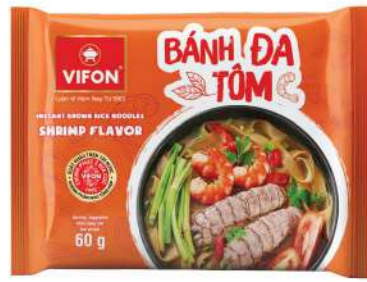
BDG04 Shrimp Flavor (60 g)