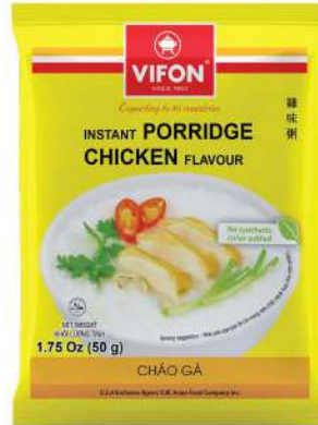
CHG02 Chicken Flavor (50 g)