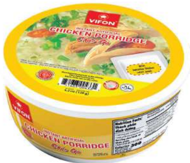
CHT03 Immitation Chicken (120 g)