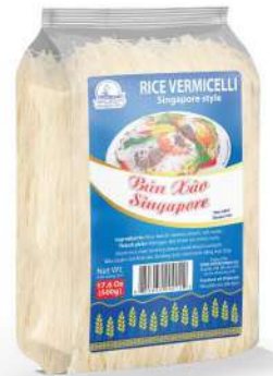
Rice Vermicelli Singapore Style (500 g)