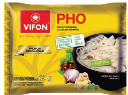
PHG01 Chicken Flavor (60 g)