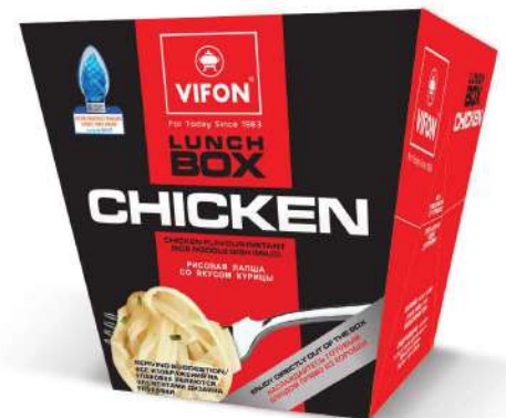
PHH03 Chicken Flavor (85 g) Saveur de poulet (85 g)