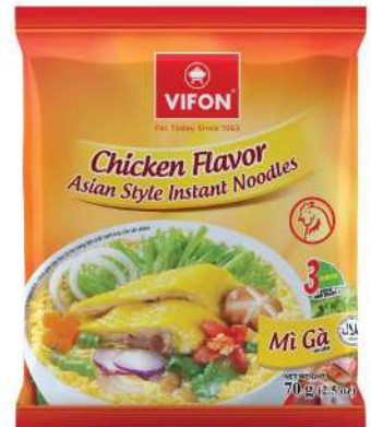
MIG21 CHICKEN FLAVOR (70 g)