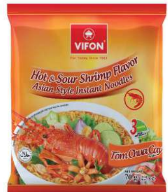
MIG22 HOT & SOUR SHRIMP FLAVOR (70 g)