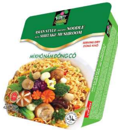
MIK02 Asian Style Instant Noodle With Mushroom (120 g)