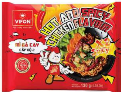
MCG04 Hot And Spicy Chicken Flavor X2 Spicy (130 g)