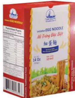
Imitation Egg Noodle 1mm (400 g)