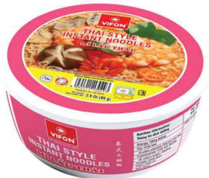
MIT05 Thai Style (85 g)