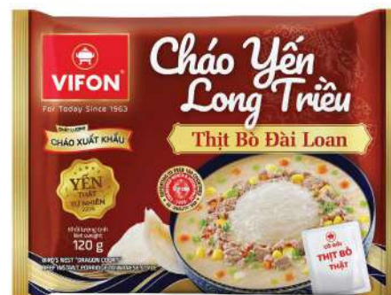
LTC02 Beef Taiwanese Flavor (120 g)