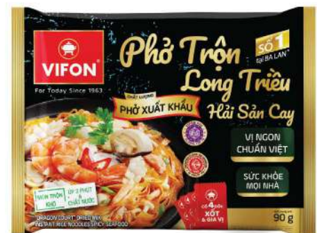
LTP04 Spicy Seafood Flavor (90 g)