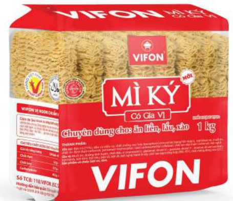
MIG50 With Seasoning (1 Kg)