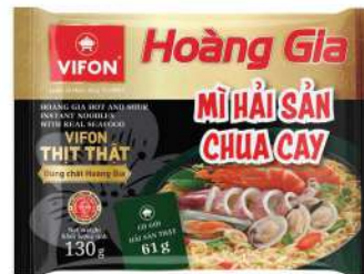
Hot And Sour With Real Seafood (130 g)