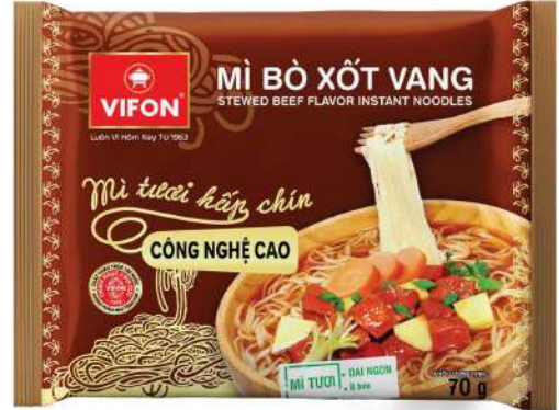
MTG01 Beef With Wine Sauce (70 g)