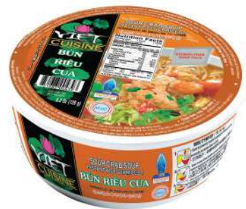
BUT01 Sour Crab Soup Instant Vermicelli 120 g