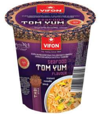
MIL08 Seafood Tom Yum Flavour (67 g)