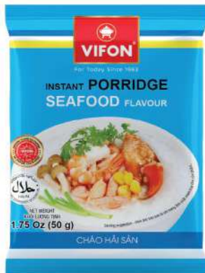
CHG04 Seafood Flavor (50 g)