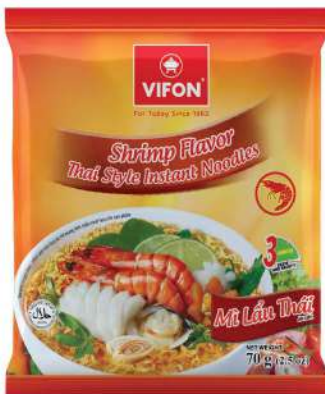
MIG24 SHRIMP FLAVOR THAI STYLE (70 g)