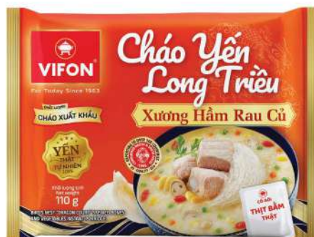
LTC01 Beef Stewed Bones And Vegetables Flavor (110 g)