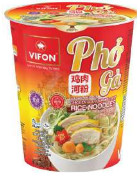
PHL02 Chicken Flavor (60 g)