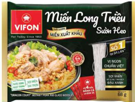
LTM01 Pork Rib Flavor (68 g)