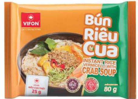
BUG02 Crab Soup (80 g) Soupe de crabe (80 g)