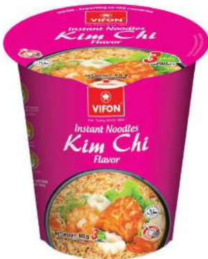
MIL04 Kim Chi Flavor (60 g)