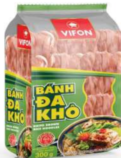
BDG02 Dried Brown Rice Noodles (300 g)