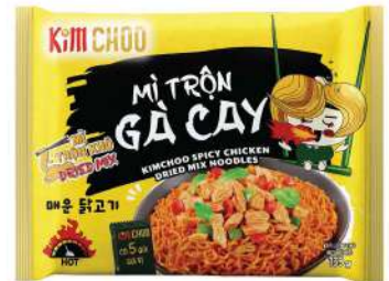
Spicy Chicken (135 g)