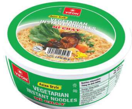
MIT03 Vegetarian (85 g)