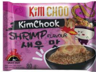
KCO06 Hot shrimp flavor (80 g)