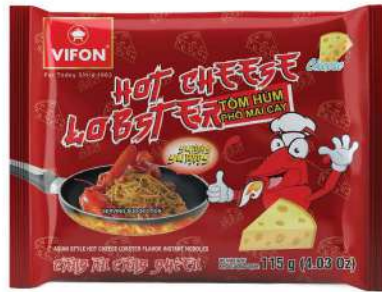
MCG02 Asian Style Hot Cheese Lobster Flavor (115 g)