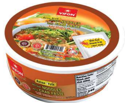
MT06 Crab Paste (120 g)