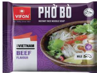
Beef Flavor (60 g)