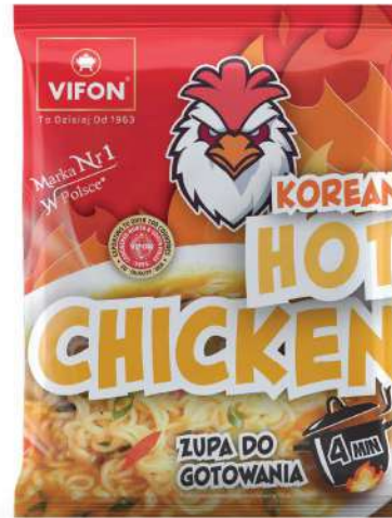
MNG02 Extra Spicy Chicken Flavour (105 g)