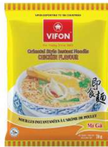
MIG014 Chicken Flavor (70 g)