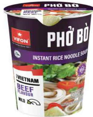
Beef Flavor (60 g)