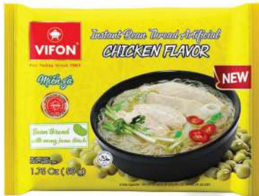
MG04 Chicken Flavor (50 g) Saveur de poulet (50 g)