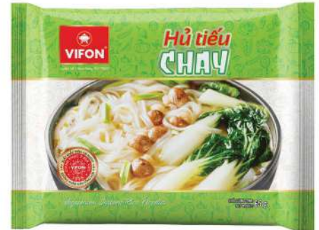
HTG04 Vegetarian (65 g)