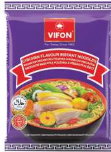
MIG08 Chicken Flavor (60 g)