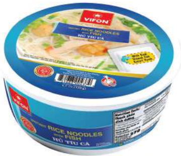
HTT02 Real Fish(120 g)