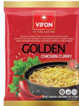
MRG07 Curry Flavor (70 g)