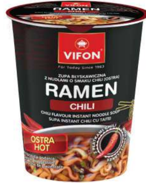
MRL02 Ramen Chili Flavor (60 g)