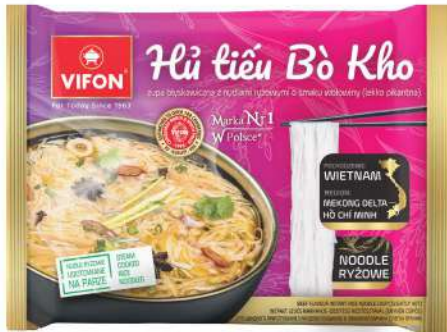
HTG02 Stewed Beef Flavor (65 g)