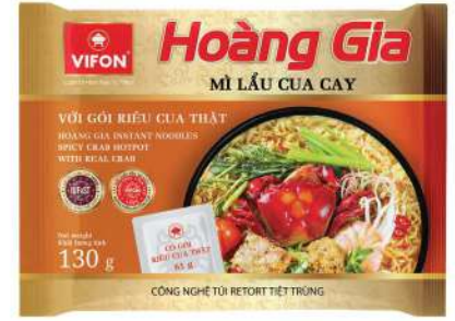
HGM03 Spicy Crab Hotpot with Real Crab (130 g)