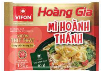
Wonton (130 g)