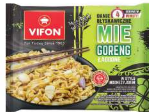
MRG04 Mie Goreng Flavor (90 g)