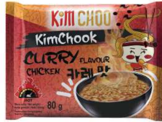
KCO07 Hot Curry chicken flavor (80 g)