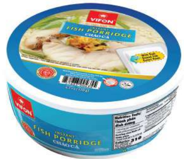
CHT01 Real Fish (120 g)