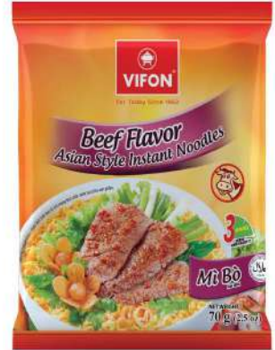
MIG20 BEEF FLAVOR (70 g)