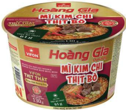
Instant Noodle With Beef (130 g)