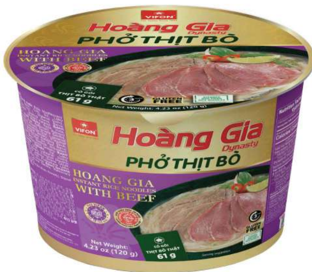
Instant Rice Noodles With Beef (120 g)