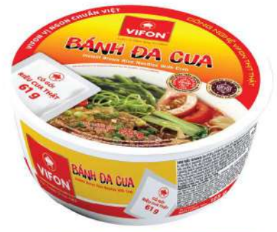
BĐT01 Real Crab (125 g)