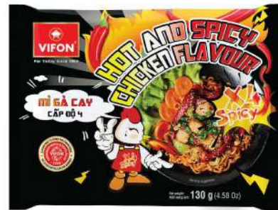
MCG05 Hot And Spicy Chicken Flavor X4 Spicy (130 g)