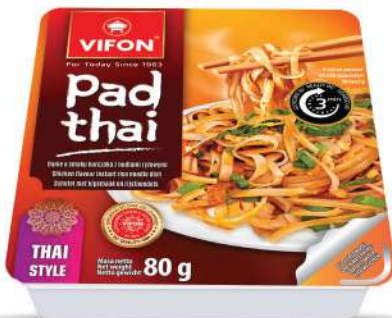
MIK01 Pad Thai Flavor (80 g)