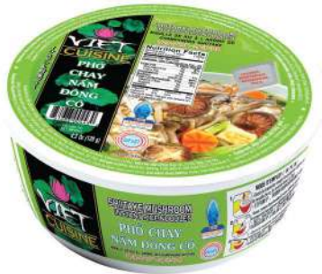
PHT07 Shiitake Mushroom Instant Rice Noodle (120 g)