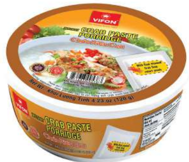
CHT04 Crab Paste (120 g)

BOWL INSTANT PORRIDGES WITH MEAT 50 g / 120 g