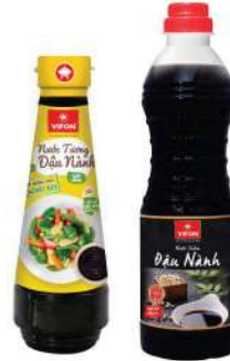
NTC01/ 02/ 03 Soy Sauce (230 ml/ 300 ml/ 500 ml)