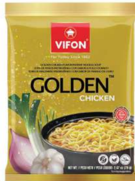
MRG06 Golden Chicken (70 g)