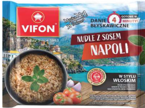
MTG01 Napoli - Italian Style Flavor in Dish (97 g)