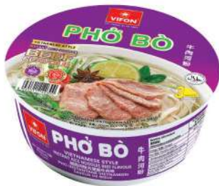
PHT01 Beef Flavor (70 g)