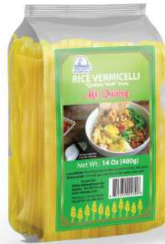
Rice Vermicelli "Quang Nam" Style (400 g)