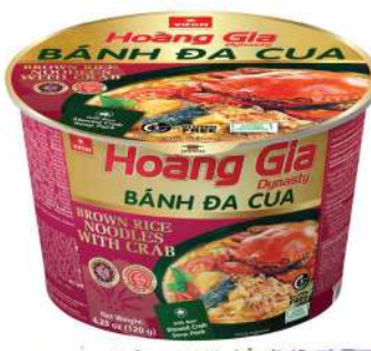
Crab flavor (120 g)