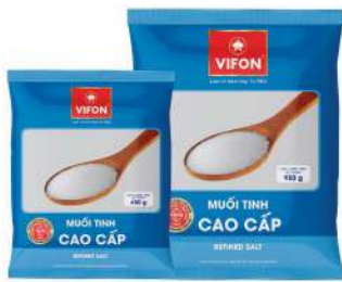
MUG01/ 02 High - Quality Salt (450 g/ 950 g)