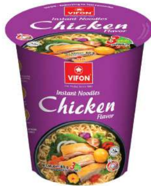
MIL02 Chicken Flavor (60 g)