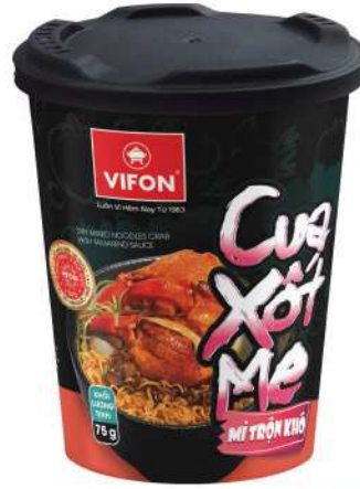
MKL01 Crab With Tamarind Sauce (75 g)