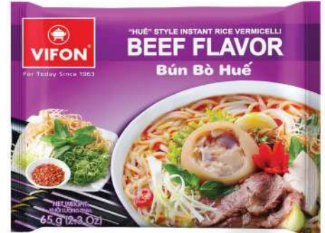
BUG01 Beef Flavor (65 g) Saveur de boeuf (65 g)