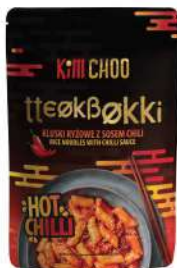
TBK01 Tteokbokki-Chilli Sauce (140 g)