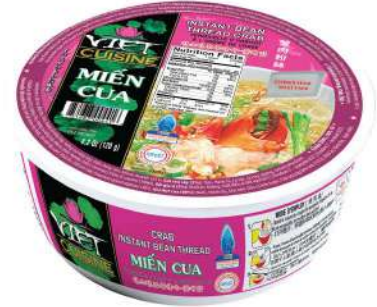
MNT02 Crab Instant Bean Thread (120 g)