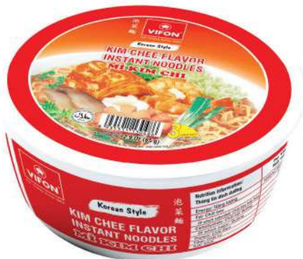
MIT04 Korean Style Kim Chi Flavor (85 g)