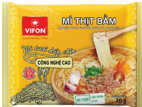
MTG03 Minced Pork (70 g)