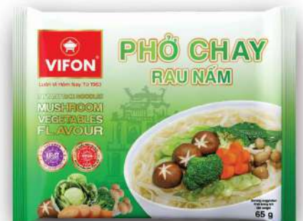
PHG03 Mushroom Vegetable Flavor (60 g)