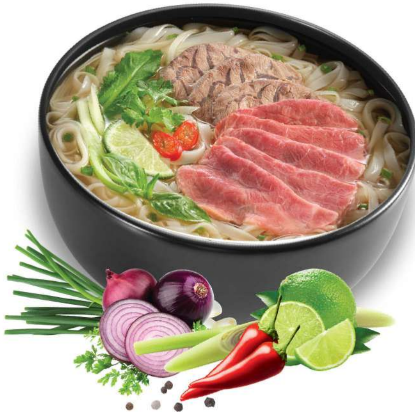
MXK05 Real Beef (120 g)