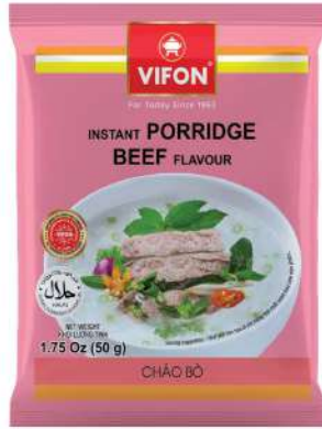
CHG01 Beef Flavor (50 g)