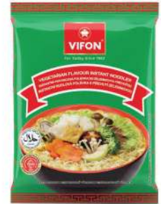
MIG10 Vegetarian (60 g)