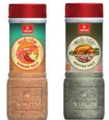
BCG04/ BCG05 Shrimp Salt (120 g)/ Pepper Salt (150 g)