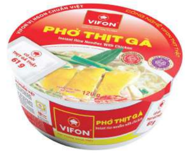
PHT05 Real Chicken (120 g)