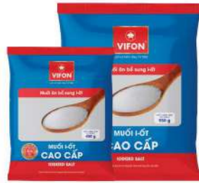
MUG03/ 04 High - Quality Iodine Salt (450 g/ 950 g)