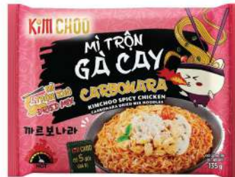
Spicy Chicken Carbonara (135 g)