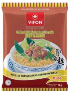
MIG013 Beef Flavor (70 g)