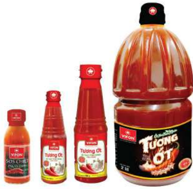
TOC01/02/03/04 Hot Chilli SAUCE (100 ml/ 260 g/ 560 g/ 2 l)