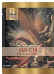
Kim Chi Broth Powder (70 g)