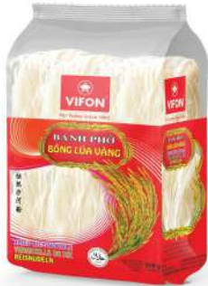
PHG07 Bong Lua Vang (500 g)