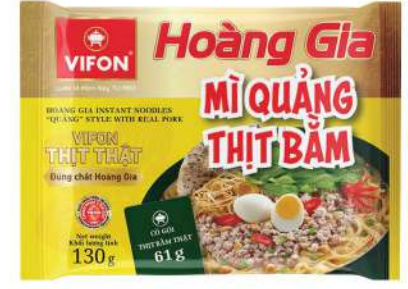
"Quang" Style With Real Minced Pork (130 g)