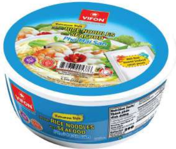
PHT06 Real Seafood (120 g)