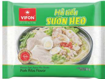
HTG03 Pork Ribs Flavor (65 g)