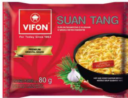
MIG02 Hot And Sour Flavour (80 g)