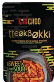
TBK01 Tteokbokki-sweet and Sour sauce (140 g)