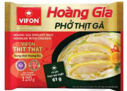
HGG02 Real Chicken (120 g)