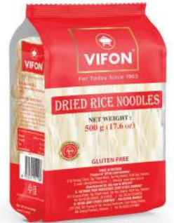
PHG06 Dried Rice Noodles (500 g)