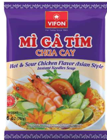
MIG06 Hot & Sour Chicken Flavor (75 g)