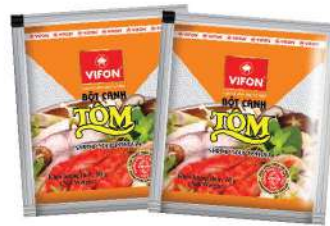
BCG03 Shrimp Soup Powder (10 g)