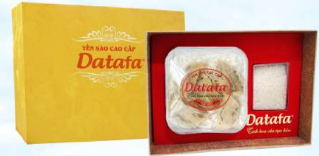
Raw Bird's Nest 50g

Refined bird's nest is raw nest that has been carefully cleaned of feathers and impurities