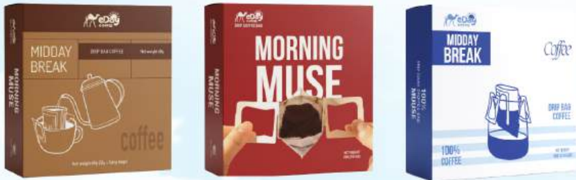
Drip Coffee Bag