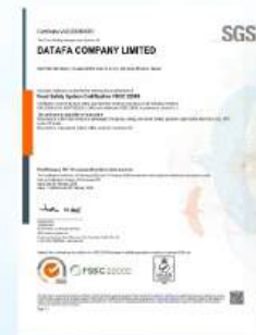
FSSC 22000 CERTIFICATE