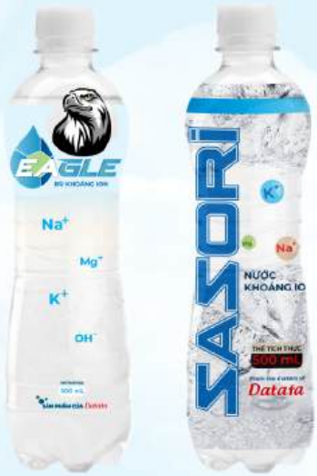
EAGLE IONIZED WATER