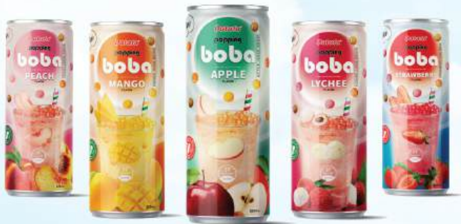
Fruit Juice with Popping Boba