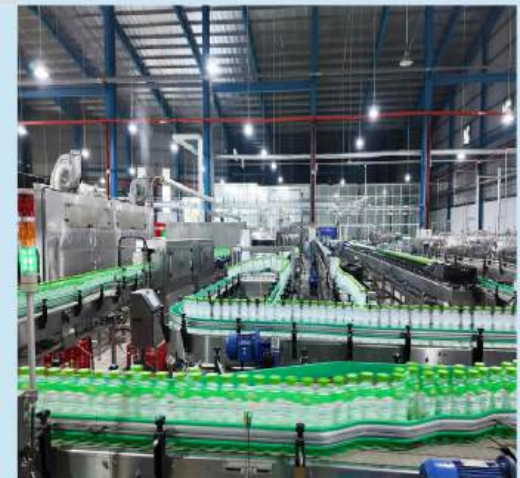
Automated Production Area