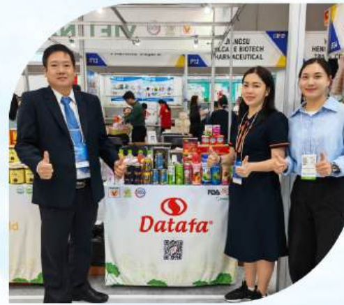
Introducing Our Fruit Beverage to the International Market