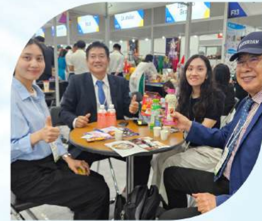
Actively Participating in International Trade Fairs