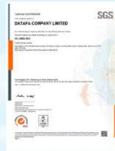
ISO 22000:2018 CERTIFICATE