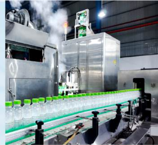
Packaging Inspection Area