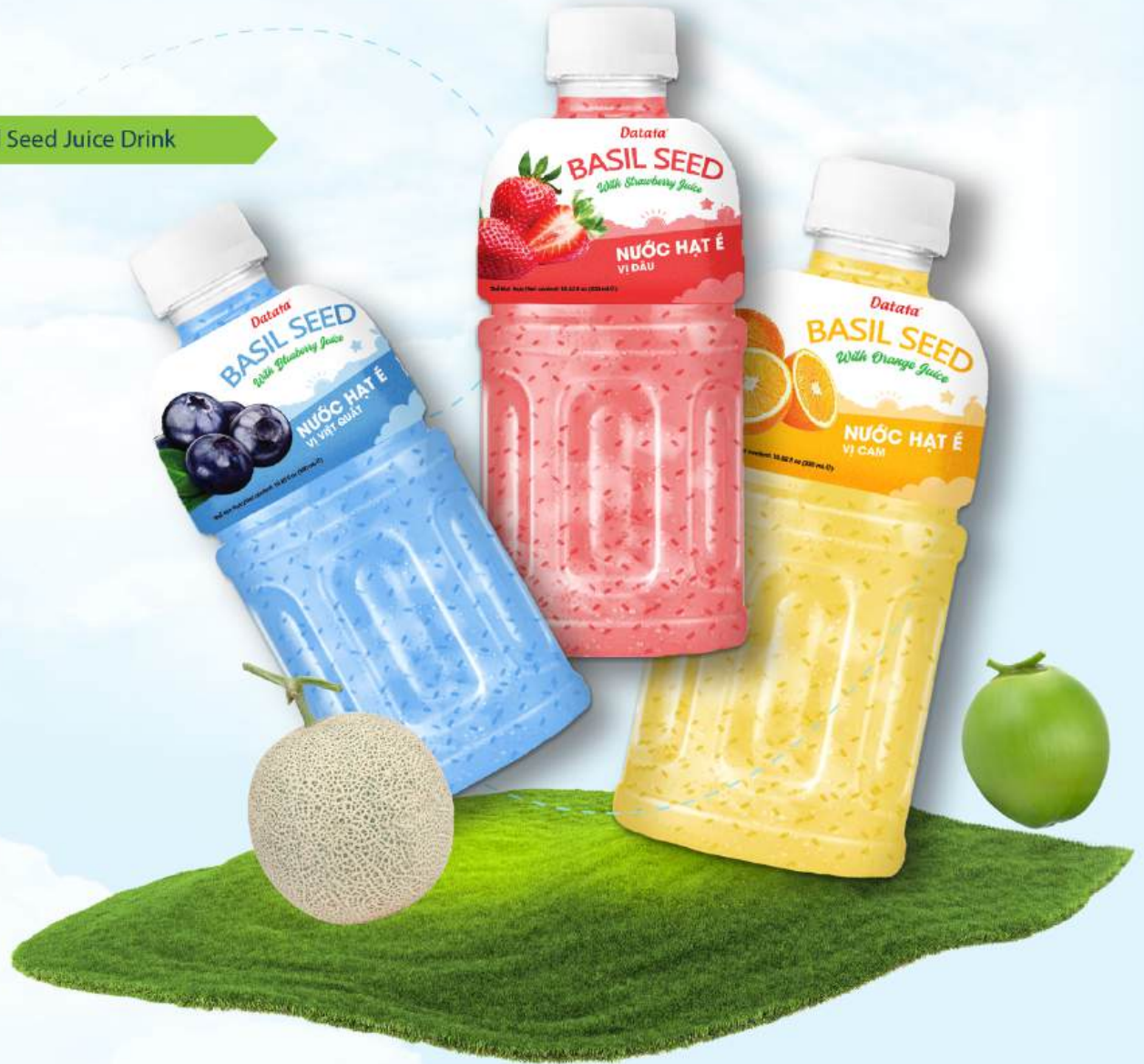
Basil Seed Juice Drink

Fruit juice with textured toppings not just refreshing, but also fun to drink. Different types of toppings make each sip more exciting and unforgettable.