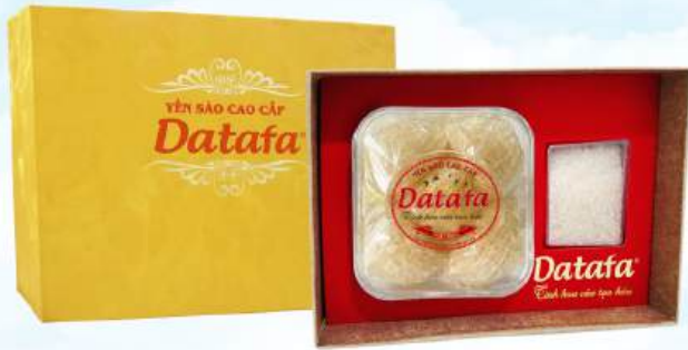
Refined Bird's Nest 100g

Refined bird's nest is raw nest that has been carefully cleaned of feathers and impurities