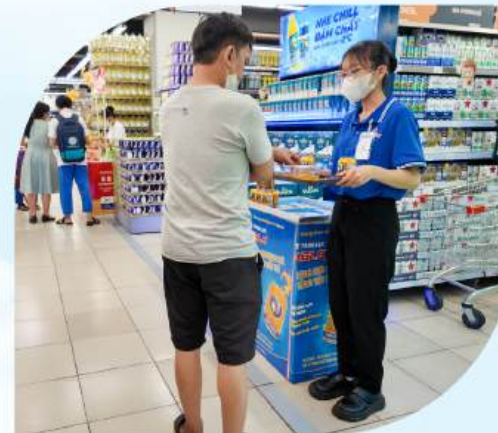
Expanding into Supermarkets and Commercial Centers