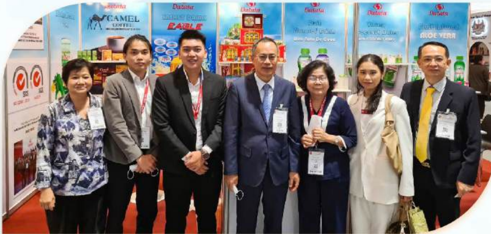
Actively engaged in events, trade exhibitions, and international cooperation to connect with local and global consumers.