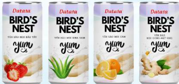
Bird's Nest Drink with Fruit (Can)