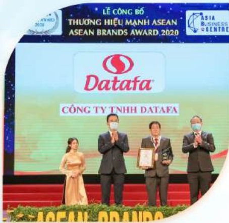
Recognized as a Strong ASEAN Brand