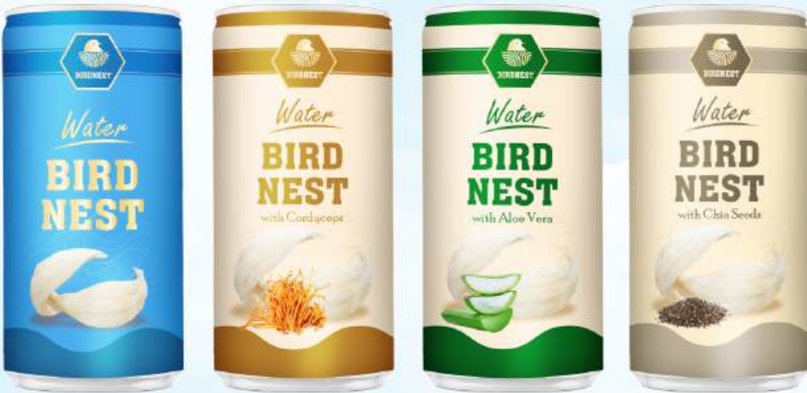
Herbal-flavored bird's nest drink

In addition to traditional bird's nest drinks, the company has developed new product lines that combine bird's nest with herbal ingredients, enhancing nutritional value and adding extra health benefits.