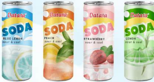
Fruit-Flavored Carbonated Drink