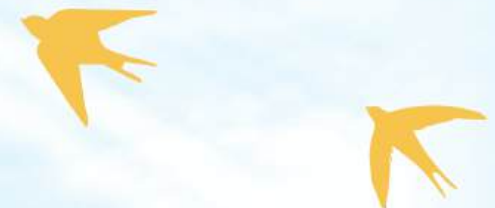
Bird's Nest Drink (Regular Can)