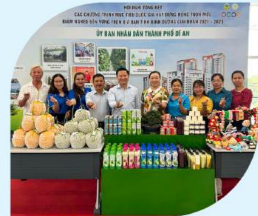
Actively Participating in City-Level OCOP Programs