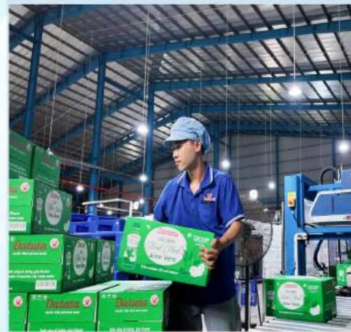
Finished Goods Area