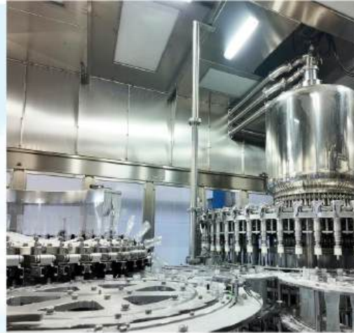
Beverage Filling Area