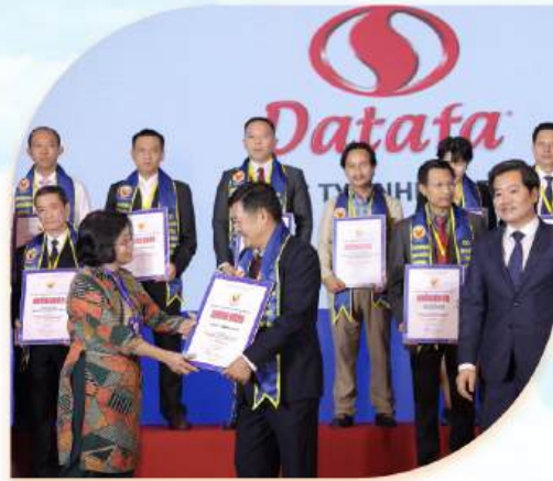
The company has actively participated in and achieved various certifications and recognitions.