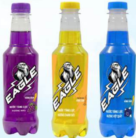
EAGLE ENERGY DRINK