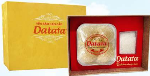
Refined Bird's Nest 50g

"Bird's nest is a precious delicacy formed from the salivary glands of swiftlets. After hours of flying and building nests in a completely natural environment, each nest crystallizes into fine, white strands rich in essential nutrients."