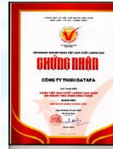
CERTIFICATE OF VIETNAMESE HIGH-QUALITY GOODS