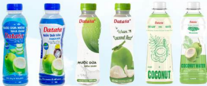
Coconut Juice with Pulp