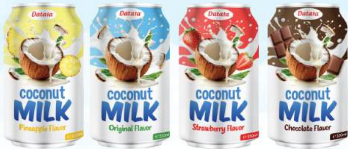
Canned Coconut Milk with Fruit Flavors