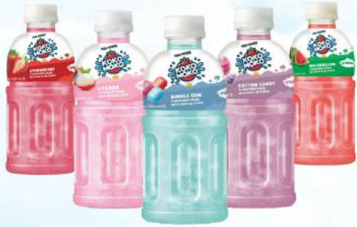
Fruit Juice With Nata De Coco