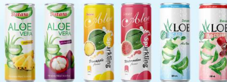
Aloe vera can