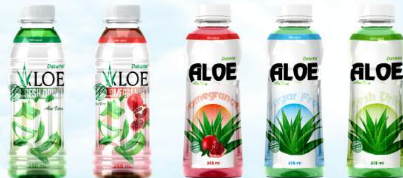
Aloe vera PET