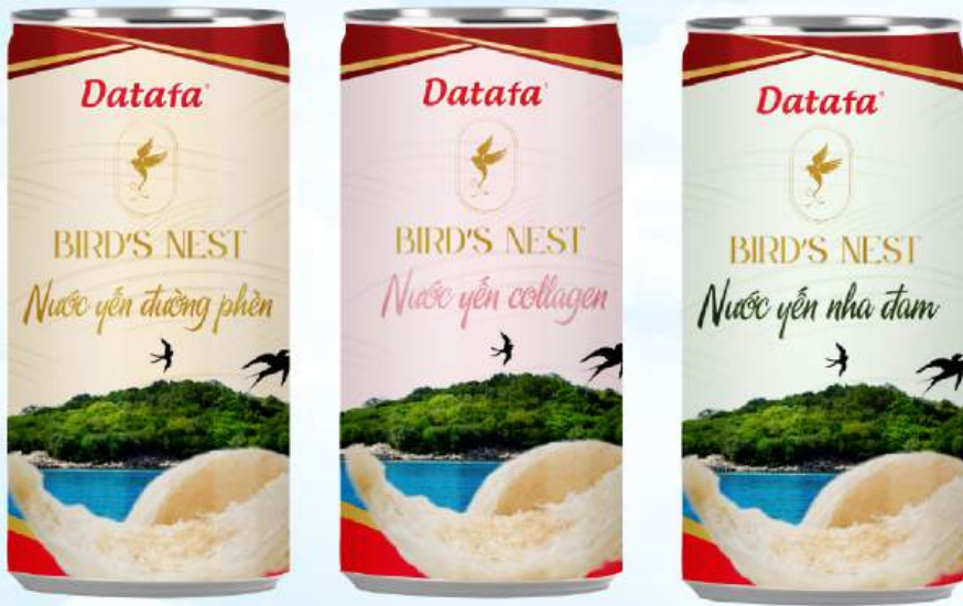
Less-sugar bird's nest refreshing drink