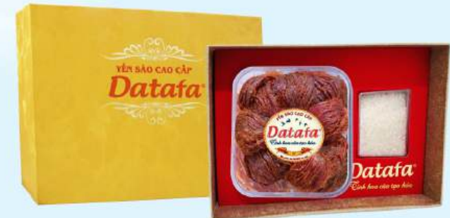
Refined Blood Nest

The structure of refined bird's nest differs from raw nests, as it has been carefully cleaned of feathers and impurities, and thoroughly sterilized before packaging.