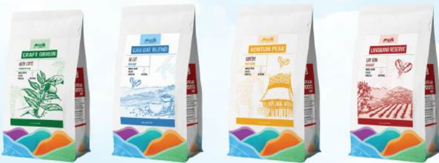
Roasted & Ground Coffee