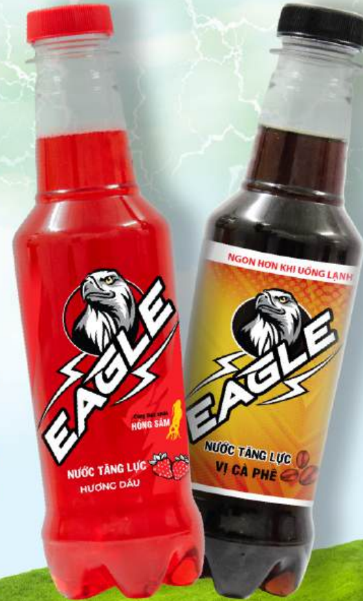
EAGLE Strawberry & Coffee Energy Drink