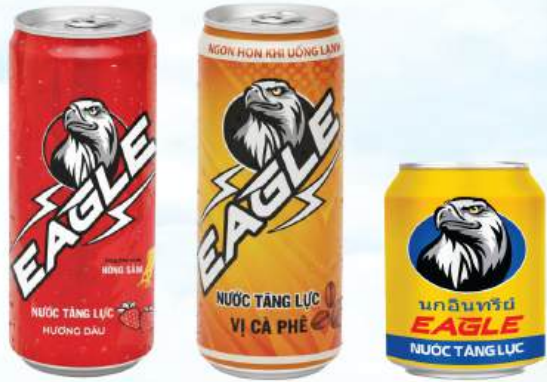
EAGLE ENERGY DRINK