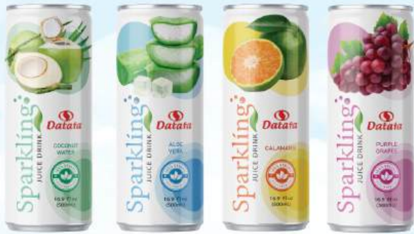
Fruit-Flavored Sparkling Drink