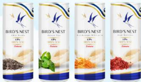
Herbal-flavored bird's nest drink