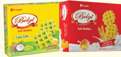
Egg & milk/ 鸡蛋牛奶味: 276 g Coconut & spring rice/ 椰子春米味: 276 g