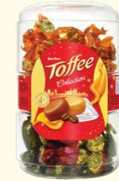
Toffee coffee & caramel candy/ 焦糖黄油太妃糖: 168 g