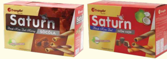
Cream filled wafer/ 脆卷: 440 g Assorted cream (Chocolate & Coconut milk cream) 综合味 (巧克力味/椰子牛奶味) Chocolate cream/ 巧克力味