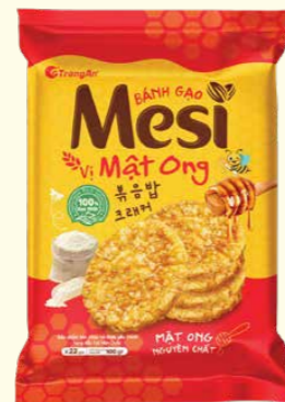
Honey fried rice cracker 蜂蜜味: 100 g