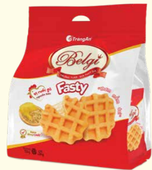
Belgi Fasty waffles Chicken Meat Floss & Egg Belgi Fasty 华夫软饼 鸡肉松蛋味: 156 g