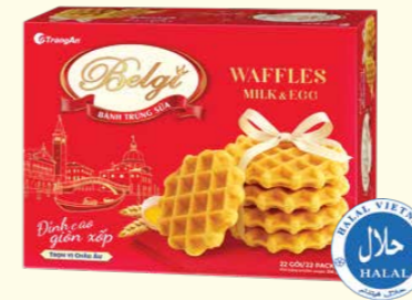
Egg & milk/ 鸡蛋牛奶味: 306 g