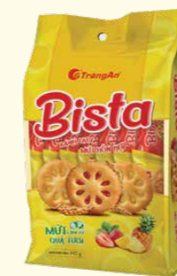
Pineapple & strawberry jam 菠萝酱和草莓酱: 192 g