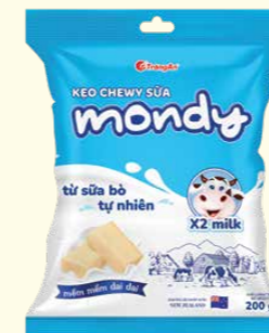
Milk/ 牛奶: 200 g