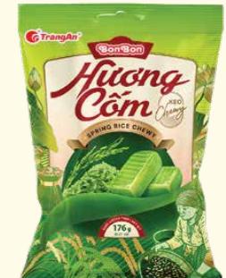
Spring rice 春米: 176 g