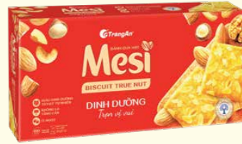
Nutritious nut/ 坚果: 105 g