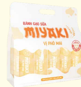
Cheese flavor 芝士味: 240 g