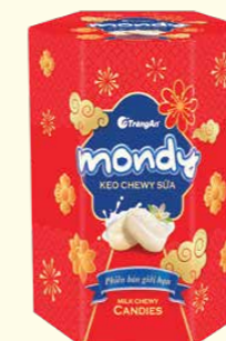
Milk/ 牛奶: 100 g