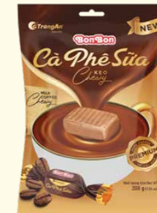
Milk & coffee 牛奶咖啡: 176 g