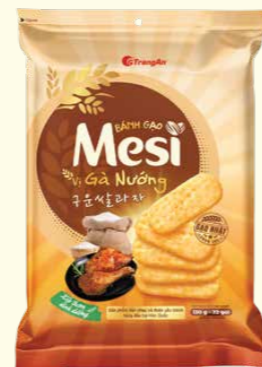
BBQ chicken flavor 烤鸡味: 130 g