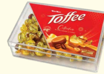
Toffee coffee & caramel candy/ 焦糖黄油太妃糖: 245 g