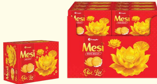
Mesì Marie biscuit Mesì Marie 饼干: 42 g