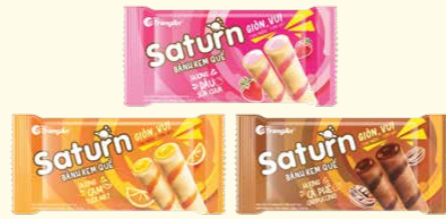
Cream filled wafer/ 脆卷: 103 g Orange cream / Strawberry cream / Cappuccino cream 橙子味/草莓味/卡布奇诺