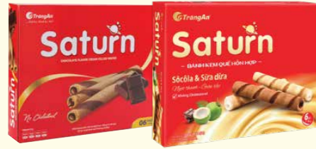
Cream filled wafer/ 脆卷: 330 g Assorted cream (Chocolate & Coconut milk cream) 综合味 (巧克力味/椰子牛奶味) Chocolate cream/ 巧克力味