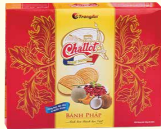
Assorted cream/ 综合味: 336 g (Coconut, Red Bean & Melon cream) (椰子味/红豆味和哈密瓜味)