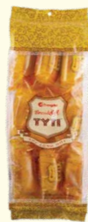
Tyti Bread/ 软面包: 162 g