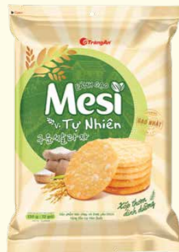
Natural flavor 原味: 130 g