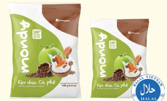
Coffee coconut/ 椰子咖啡味: 85 g / 188 g