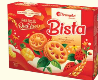
Pineapple & strawberry jam 菠萝酱和草莓酱: 366 g