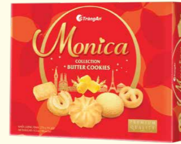
Monica butter cookies Monica 黄油曲奇饼干: 270 g