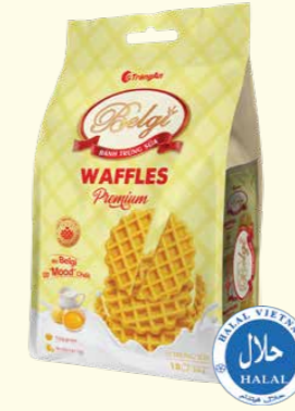
Egg & milk 鸡蛋牛奶味: 250 g