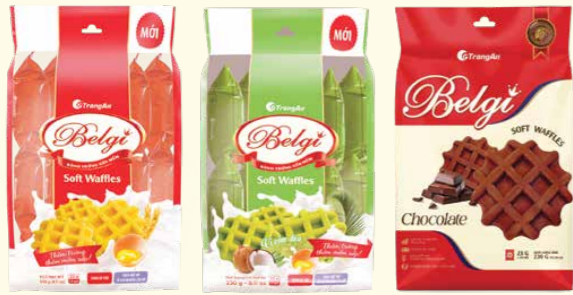
Egg & milk/ 鸡蛋牛奶味: 230 g Coconut & spring rice/ 椰子春米味: 230 g Chocolate/ 巧克力味: 230 g