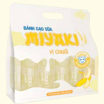
Banana flavor 香蕉味: 240 g