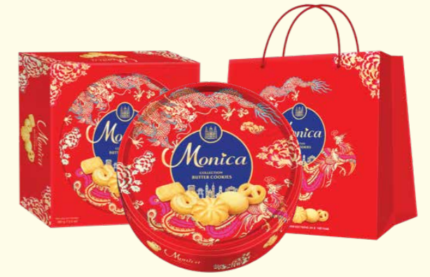
Monica butter cookies Monica 黄油曲奇饼干: 380 g