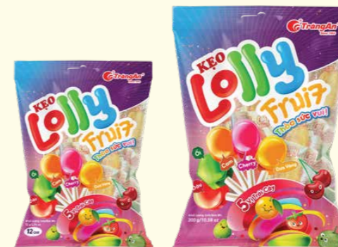
Fruity flavor/ 综合水果: 72 g / 300 g (Orange, Strawberry, Cherry, Guava & Melon) (橙字, 草莓, 樱桃, 番石榴, 哈密瓜)