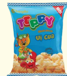
Crab flavor 蟹味 7 g / 16 g / 35 g