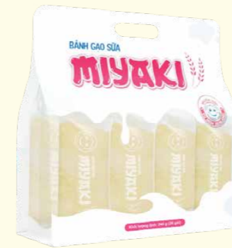
Milk flavor 牛奶味: 240 g