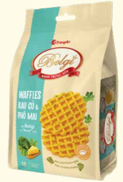
Vegetables & Cheese 蔬菜芝士味: 250 g