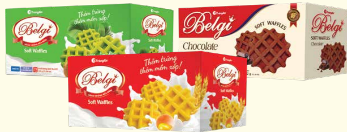
Egg & milk/ 鸡蛋牛奶味: 322 g Coconut & spring rice/ 椰子春米味: 322 g Chocolate/ 巧克力味: 322 g