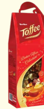
Toffee coffee & caramel candy/ 焦糖黄油太妃糖: 180 g