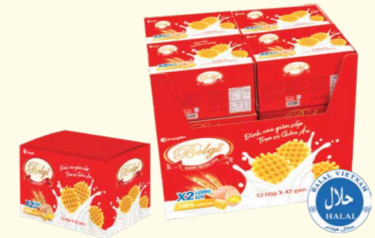
Egg & milk/ 鸡蛋牛奶味: 42 g