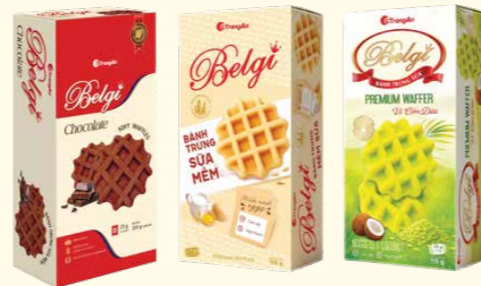
Egg & milk/ 鸡蛋牛奶味: 115 g Coconut & spring rice/ 椰子春米味: 115 g Chocolate/ 巧克力味: 115 g