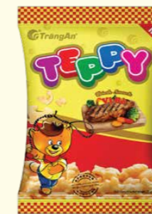
Beef flavor 牛肉味 7 g / 16 g / 35 g