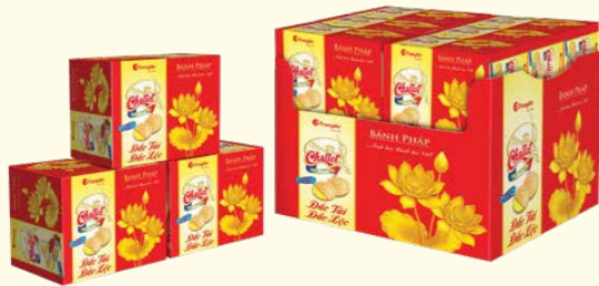
Challot French pancake 法国薄饼夹心: 42 g