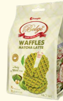
Matcha Latte 抹茶拿铁味: 250 g