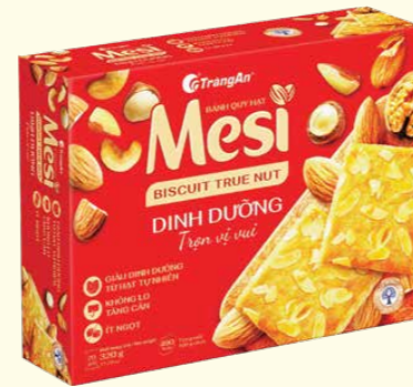
Nutritious nut/ 坚果: 320 g