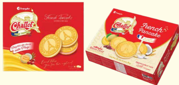
Challot French pancake 法国薄饼夹心: 270 g