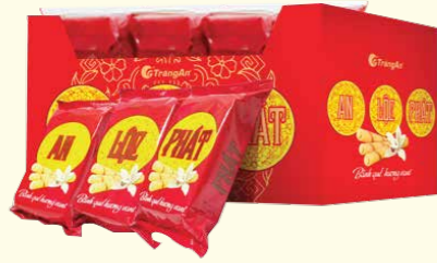
Without cream/ 无奶油: 60 g Vanilla/ 香草