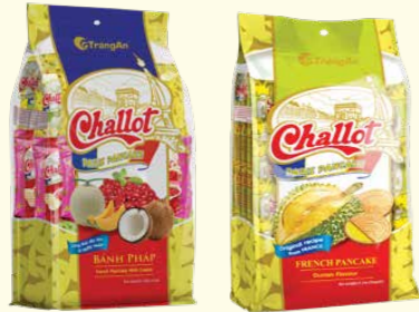
Assorted cream/ 综合味: 260 g (Coconut, Red Bean & Melon cream) (椰子味/红豆味和哈密瓜味) Durian cream/ 榴莲味: 260 g