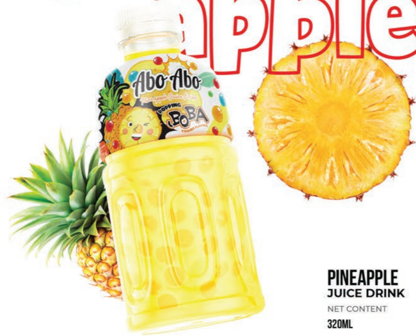
PINEAPPLE JUICE DRINK NET CONTENT 320ML