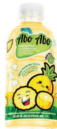
PINEAPPLE FLAVORED DRINK NET CONTENT 320ML