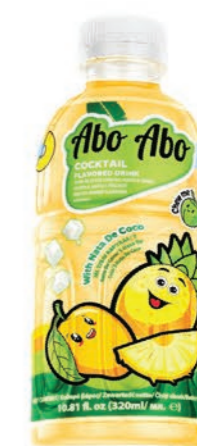
COCKTAIL FLAVORED DRINK NET CONTENT 320ML