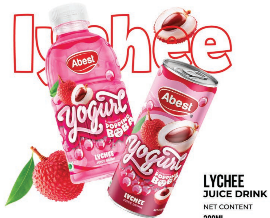
LYCHEE JUICE DRINK NET CONTENT 320ML