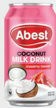
COCONUT MILK DRINK STRAWBERRY FLAVOUR NET CONTENT 330ML