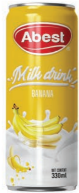
BANANA MILK DRINK NET CONTENT 330ML