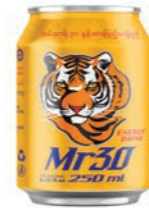
MR30 ENERGY DRINK NET CONTENT 250ML