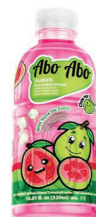
GUAVA FLAVORED DRINK NET CONTENT 320ML