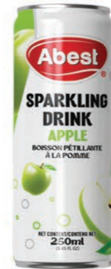
APPLE SPARKLING DRINK NET CONTENT 250ML