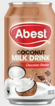
COCONUT MILK DRINK CHOCOLATE FLAVOUR NET CONTENT 330ML