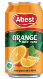
ORANGE JUICE DRINK NET CONTENT 330ML