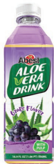
GRAPE FLAVOR NET CONTENT 320ML, 500ML