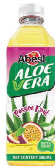
PASSION FRUIT FLAVOR NET CONTENT 320ML, 500ML