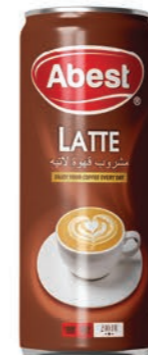
LATTE COFFEE NET CONTENT 240ML