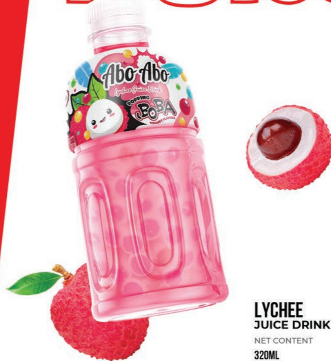
LYCHEE JUICE DRINK NET CONTENT 320ML