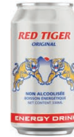
RED TIGER ENERGY DRINK NET CONTENT 250ML, 330ML