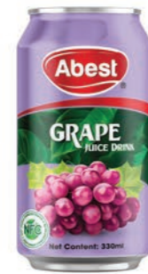
GRAPE JUICE DRINK NET CONTENT 330ML