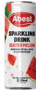
WATERMELON SPARKLING DRINK NET CONTENT 250ML