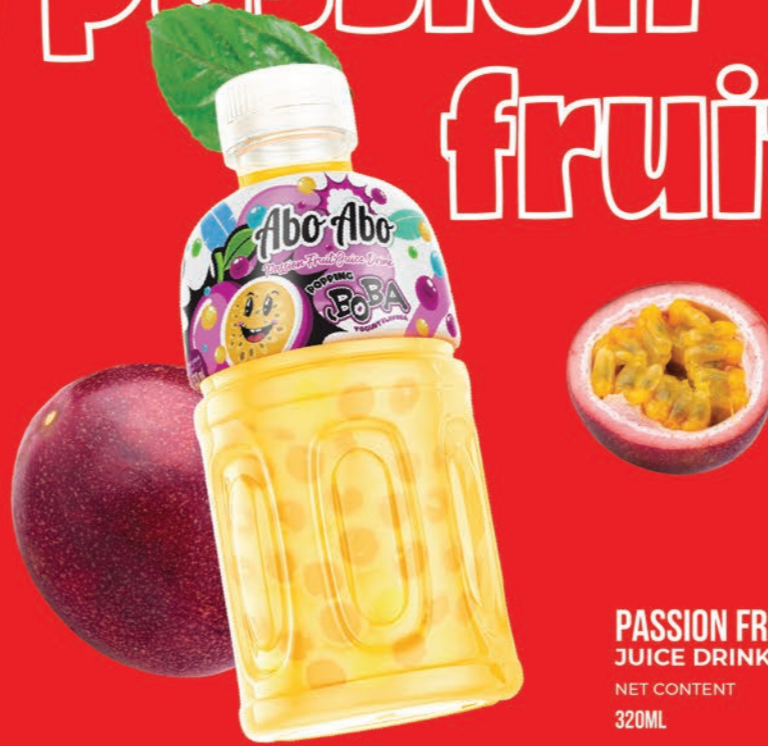
PASSION FRUIT JUICE DRINK NET CONTENT 320ML