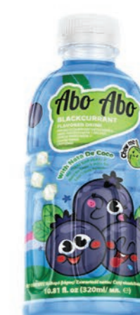
BLACKCURRANT FLAVORED DRINK NET CONTENT 320ML