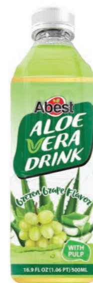
GREEN GRAPE FLAVOR NET CONTENT 320ML, 500ML