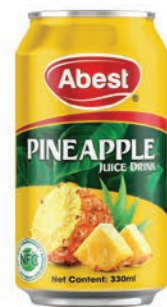
PINEAPPLE JUICE DRINK NET CONTENT 330ML