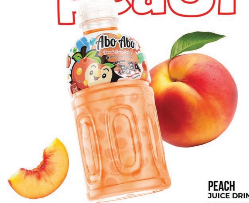
PEACH JUICE DRINK NET CONTENT 320ML