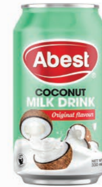
COCONUT MILK DRINK ORIGINAL FLAVOUR NET CONTENT 330ML