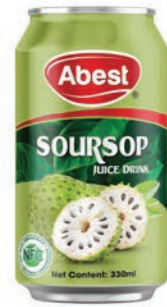
SOURSOP JUICE DRINK NET CONTENT 330ML