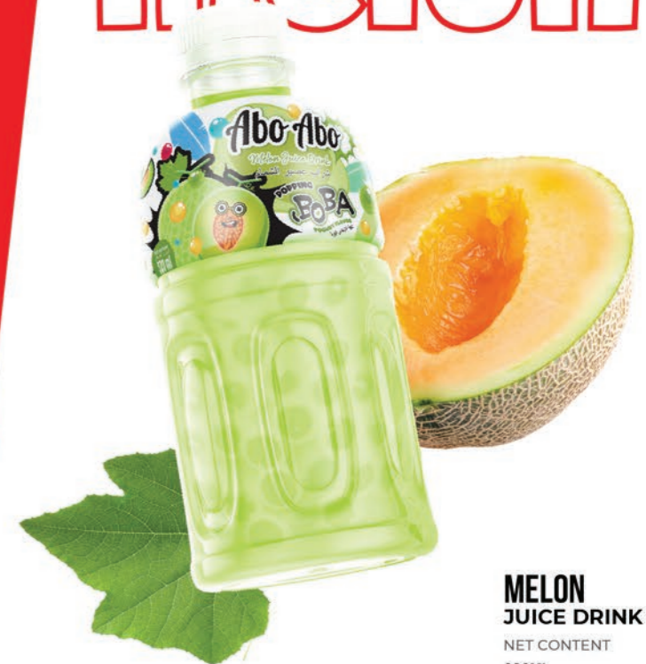
MELON JUICE DRINK NET CONTENT 320ML