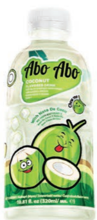
COCONUT FLAVORED DRINK NET CONTENT 320ML