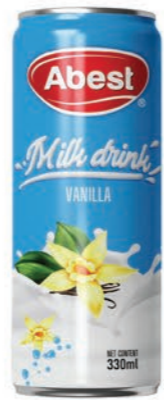
VANILLA MILK DRINK NET CONTENT 330ML