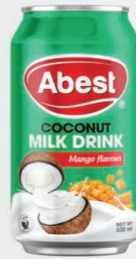
COCONUT MILK DRINK MANGO FLAVOUR NET CONTENT 330ML