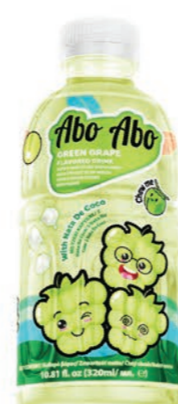
GREEN GRAPE FLAVORED DRINK NET CONTENT 320ML