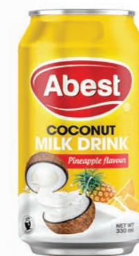
COCONUT MILK DRINK PINEAPPLE FLAVOUR NET CONTENT 330ML