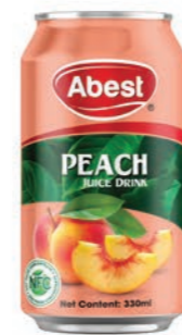
PEACH JUICE DRINK NET CONTENT 330ML