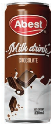
CHOCOLATE MILK DRINK NET CONTENT 330ML