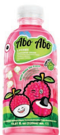
LYCHEE FLAVORED DRINK NET CONTENT 320ML