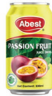
PASSION FRUIT JUICE DRINK NET CONTENT 330ML