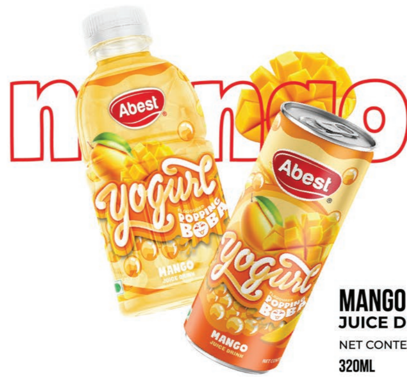
MANGO JUICE DRINK NET CONTENT 320ML