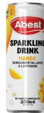
MANGO SPARKLING DRINK NET CONTENT 250ML