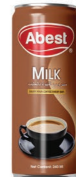
MILK COFFEE NET CONTENT 240ML