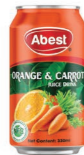
ORANGE & CARROT JUICE DRINK NET CONTENT 330ML