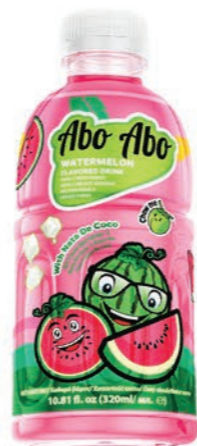
WATERMELON FLAVORED DRINK NET CONTENT 320ML