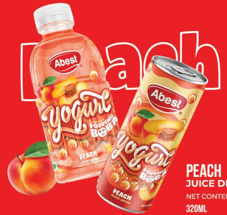
PEACH JUICE DRINK NET CONTENT 320ML