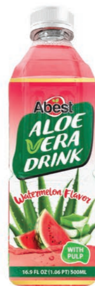
WATERMELON FLAVOR NET CONTENT 320ML, 500ML