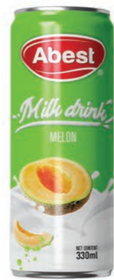
MELON MILK DRINK NET CONTENT 330ML