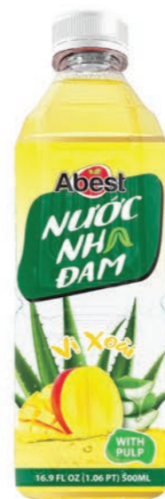
MANGO FLAVOR NET CONTENT 320ML, 500ML