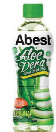
ORIGINAL FLAVOR NET CONTENT 350ML