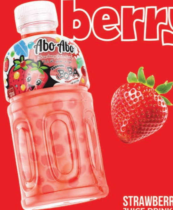
STRAWBERRY JUICE DRINK NET CONTENT 320ML