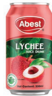
LYCHEE JUICE DRINK NET CONTENT 330ML