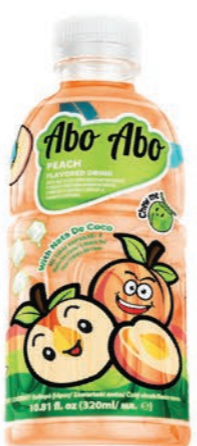
PEACH FLAVORED DRINK NET CONTENT 320ML