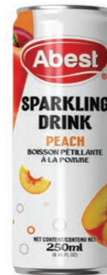
PEACH SPARKLING DRINK NET CONTENT 250ML