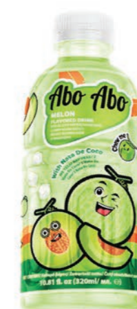
MELON FLAVORED DRINK NET CONTENT 320ML