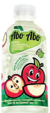
APPLE FLAVORED DRINK NET CONTENT 320ML