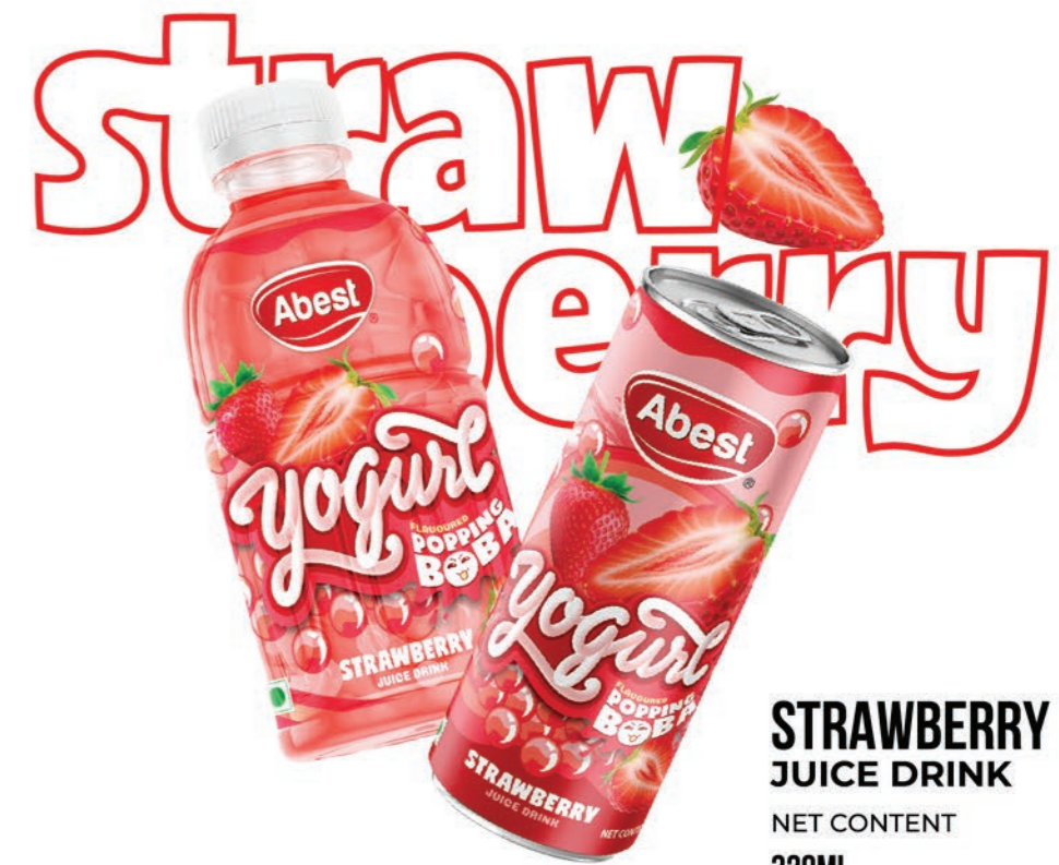
STRAWBERRY JUICE DRINK NET CONTENT 320ML