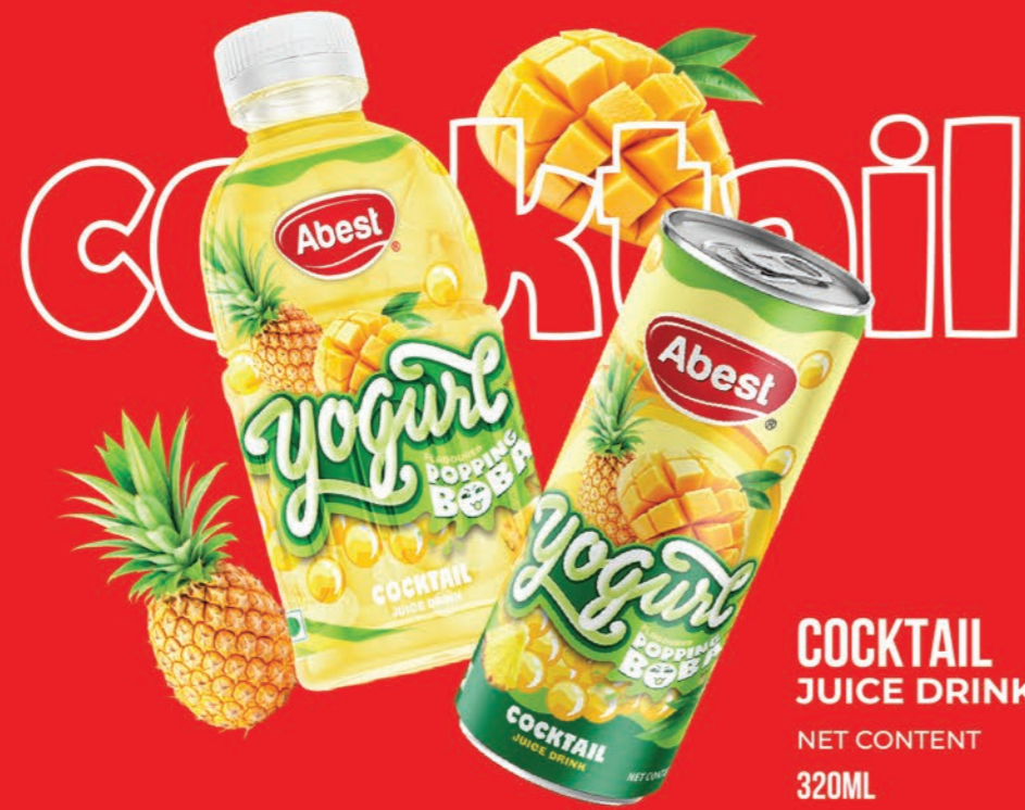
COCKTAIL JUICE DRINK NET CONTENT 320ML