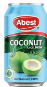
COCONUT JUICE DRINK NET CONTENT 330ML