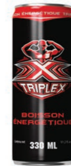
TRIPLEX ENERGY DRINK NET CONTENT 250ML, 330ML