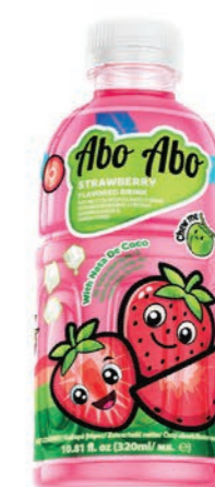
STRAWBERRY FLAVORED DRINK NET CONTENT 320ML