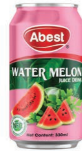
WATER MELON JUICE DRINK NET CONTENT 330ML