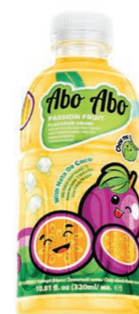
PASSION FRUIT FLAVORED DRINK NET CONTENT 320ML