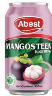
MANGO STEEN JUICE DRINK NET CONTENT 330ML