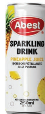
PINEAPPLE SPARKLING DRINK NET CONTENT 250ML