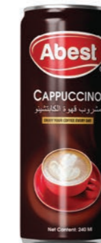
CAPPUCCINO COFFEE NET CONTENT 240ML