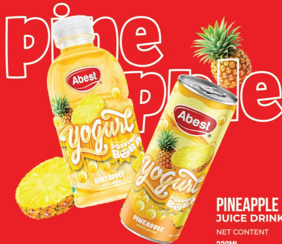
PINEAPPLE JUICE DRINK NET CONTENT 320ML