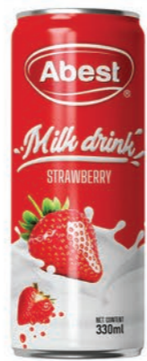
STRAWBERRY MILK DRINK NET CONTENT 330ML