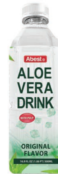
ORIGINAL FLAVOR NET CONTENT 500ML