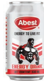
ABEST ENERGY DRINK NET CONTENT 330ML