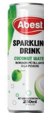
COCONUT WATER SPARKLING DRINK NET CONTENT 250ML