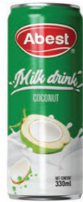
COCONUT MILK DRINK NET CONTENT 330ML