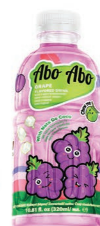
GRAPE FLAVORED DRINK NET CONTENT 320ML