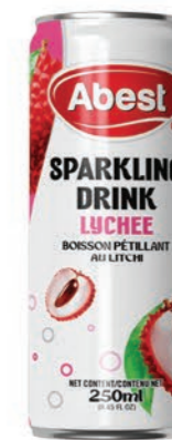
LYCHEE SPARKLING DRINK NET CONTENT 250ML