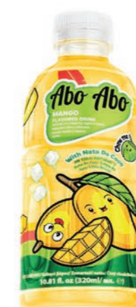
MANGO FLAVORED DRINK NET CONTENT 320ML