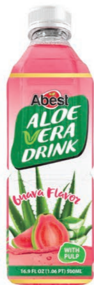
GUAVA FLAVOR NET CONTENT 320ML, 500ML