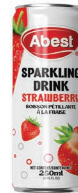
STRAWBERRY SPARKLING DRINK NET CONTENT 250ML