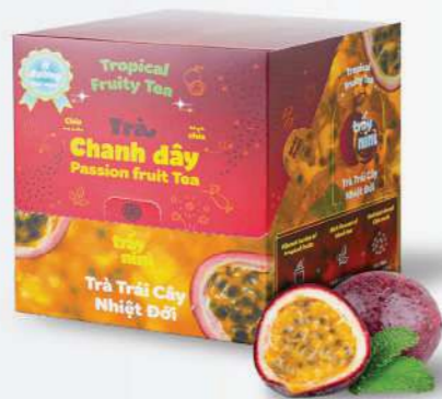
Passion Fruit Tea with Chia Seeds