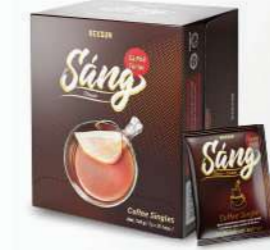
NEOLASSIC FILTER BAG COFFEE 140 g

Pure Arabica and Robusta blend – bold, slightly tangy, with a smooth, sweet finish.