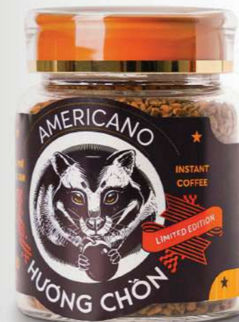
Freeze-Dried Instant Coffee