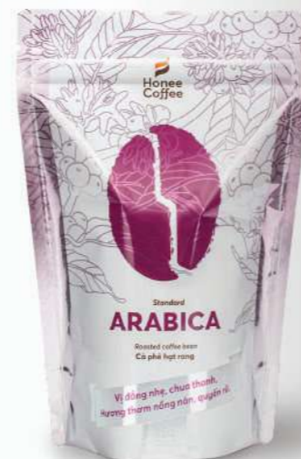
Roasted Coffee Beans