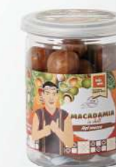
FRESH MACADAMIA NUTS IN SHELL 250 g

Crafted from ripe, juicy mangoes with a fragrant aroma, offering a gentle sweetness without being overpowering, and extremely low in calories.