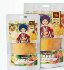
SOFT-DRIED MANGO 100 g / 200 g / 1 kg

Made from 100% fresh coconut meat, no sugar, no preservatives, delivering a rich, nutty flavor.