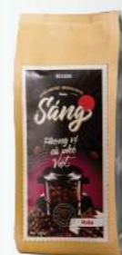
100% PURE MOKA 450 g

Delicate, fragrant notes of fruit and floral undertones, sourced from high-altitude Vietnamese plantations.