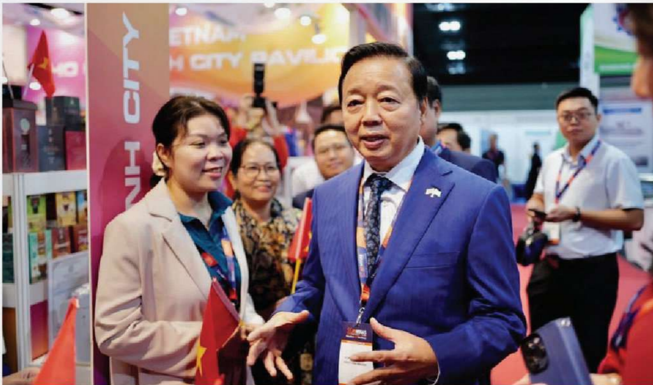
Global Halal Conference in Malaysia