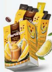
DURIAN INSTANT COFFEE 160 g

Contains 100 ultra-convenient and economical sachets.