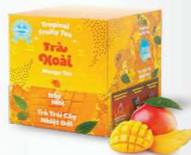
CHIA SEED MANGO TEA 100 g

The natural tangy flavor of passion fruit, not too sharp but gentle, with a light sweetness from natural rock sugar.