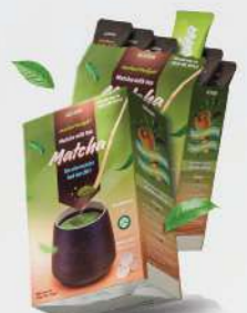
MATCHA MILK TEA 160 g

Pure matcha directly imported from Japan, with a gentle and elegant aroma, a delicately sweet flavor that leaves no lingering greasy sensation.