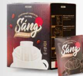
DRIP BAG COFFEE NO SUGAR, NO MILK 100 g

Pure Robusta drip bag coffee from Dak Lak, delivering bold, authentic Vietnamese flavor without sugar or creamer.