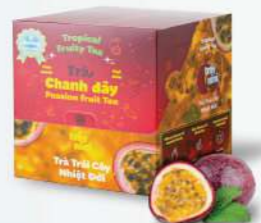
CHIA SEED PASSION FRUIT TEA 100 g

The rich, authentic taste of black tea blends perfectly with the fragrant, sweet, and refreshing aroma of lychee.