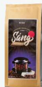
100% PURE ARABICA 450 g

Rich, full-bodied taste with a smooth texture and subtle sweetness, crafted from premium peaberry beans.