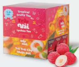
CHIA SEED LYCHEE TEA 100 g

The rich, authentic taste of black tea blends perfectly with the fragrant, sweet, and refreshing aroma of lychee.