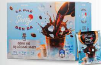
RICH BLACK COFFEE 2-IN-1 120 g

Intense Vietnamese black coffee with pure cane sugar, delivering bold flavor and authentic strength.