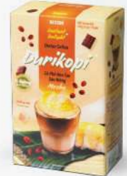
BOLD DURIAN COFFEE 160 g

The refreshing taste of tropical coconut milk, delicately blended with the subtle bitterness of pure coffee.