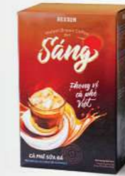
BOLD ICED MILK COFFEE 3IN1 180 g

The rich, authentic flavor of traditional coffee from pure coffee beans, combined with the gentle sweetness of natural raw sugar.