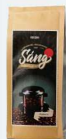
100% PURE CULI 450 g

Bold, intense flavor with a deep, lingering aftertaste – the authentic essence of Vietnamese coffee.