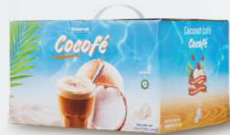
COCOFÉ DELICATE COCONUT COFFEE - VALUE PACK Box 1.6 kg (100 sachets)

Smooth fusion of robust coffee and creamy coconut milk, delivering a tropical, aromatic indulgence.