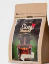
CHOCOLATE BOLD BLEND 250 / 500 g

Deep, velvety Arabica combined with robust Robusta, offering complex chocolate and nutty undertones.