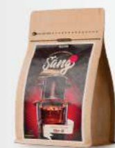
STRONG & BOLD BLEND 250 / 500 g

A powerful fusion of premium Robusta varieties, delivering intense strength and rich body.