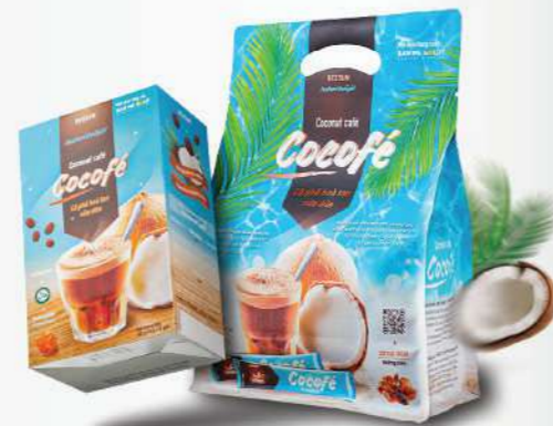
COCOFÉ DELICATE COCONUT COFFEE 160 g / 480 g

Rich, authentic Vietnamese iced coffee flavor with premium milk and pure cane sugar for an indulgent, refreshing experience.