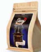
MOCHA BOLD BLEND 250 / 500 g

A powerful fusion of premium Robusta varieties, delivering intense strength and rich body.