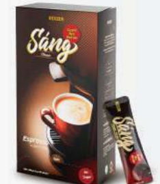
INSTANT ESPRESSO 100 g

Bold and intense pure coffee – served without sugar or milk.