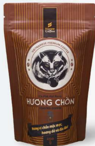
Weasel Flavor Coffee Beans