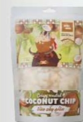
CRISPY DRIED COCONUT (NO SUGAR) 50 g / 100 g

Made from 100% fresh coconut meat, no sugar, no preservatives, delivering a rich, nutty flavor.