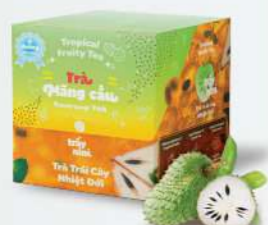
CHIA SEED SOURSOP TEA 100 g

The intense aroma reminiscent of ripe, juicy mangoes, with the light tangy taste of mango perfectly harmonizing with the smooth sweetness of tea.