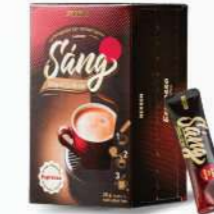
INSTANT ESPRESSO 20 g

Intense Vietnamese black coffee with pure cane sugar, delivering bold flavor and authentic strength.