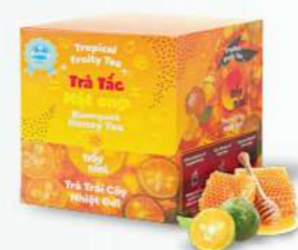
CHIA SEED KUMQUAT HONEY TEA 100 g

The pleasantly sweet flavor of soursop, not overly sweet, just enough to gently and delicately stimulate the taste buds.