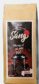
100% PURE ROBUSTA 450 g

Bold, intense flavor with a deep, lingering aftertaste – the authentic essence of Vietnamese coffee.