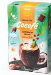
BOLD COCONUT COFFEE 160 g

The rich, authentic flavor of traditional coffee from pure coffee beans, combined with the gentle sweetness of natural raw sugar.