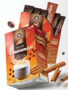
CINNAMON INSTANT COFFEE 160 g

Bold coffee infused with authentic durian essence, offering a unique, creamy, and intensely aromatic experience.