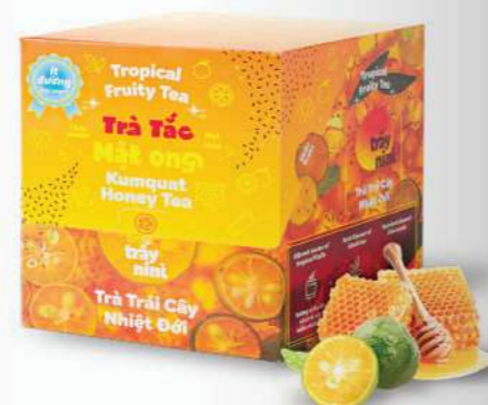
Honey Kumquat Tea with Chia Seeds