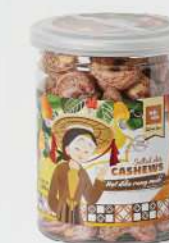
SALTED ROASTED CASHEWS WITH SKIN 250 g / 500 g

Carefully selected from high-quality sources, macadamia nuts are rich in nutrients and beneficial plant compounds, with a mild sweetness and gentle aroma.