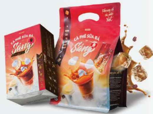
DELICATE ICED MILK COFFEE 3-IN-1 216 g / 540 g

Rich, authentic Vietnamese iced coffee flavor with premium milk and pure cane sugar for an indulgent, refreshing experience.