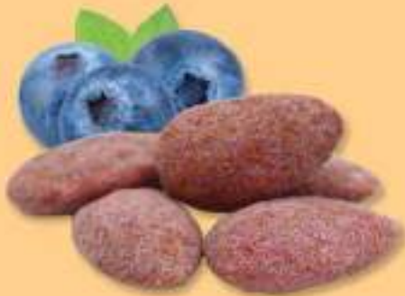
● Blueberry Almonds