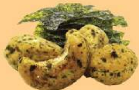
● Seaweed Cashews