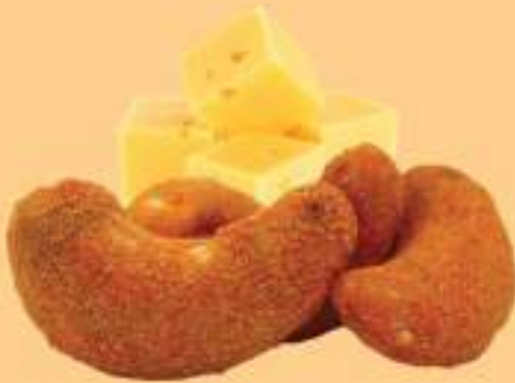
● Cheese Cashews