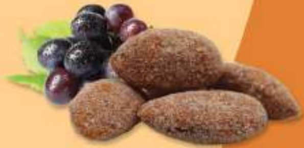
● Grape Almonds