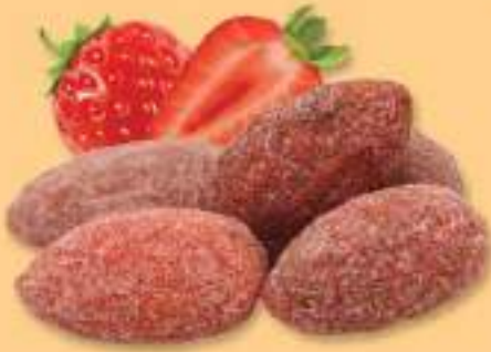
● Strawberry Almonds