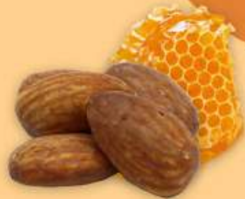
● Honey Almonds