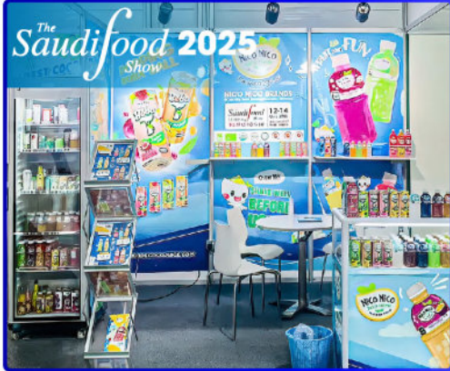
SAUDI ARABIA 2025