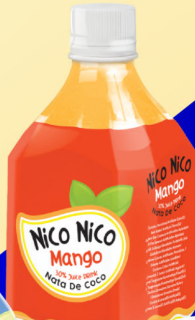
Juice with Nata de coco PET 1000ML