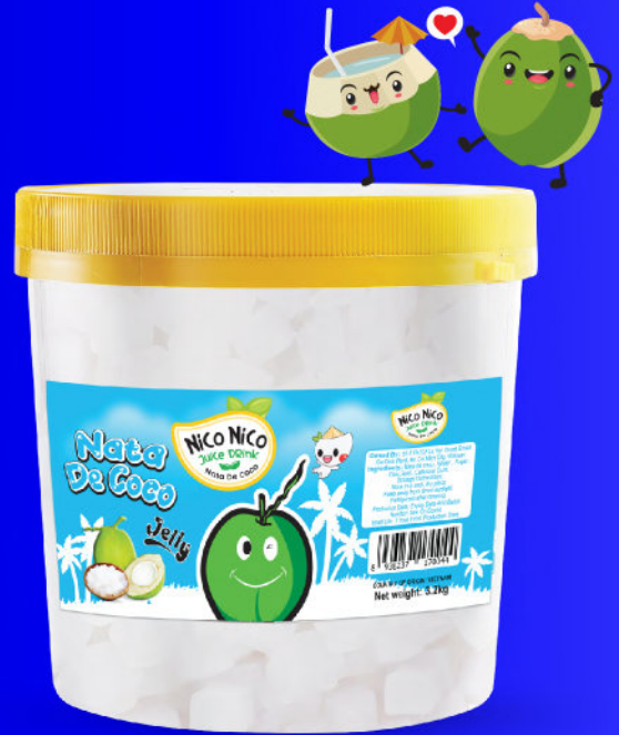
Nata de coco Jelly PLASTIC BOX 3.2KG