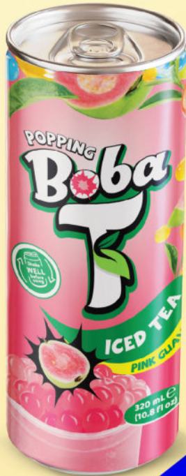
Boba popping Ice tea CAN 320ML