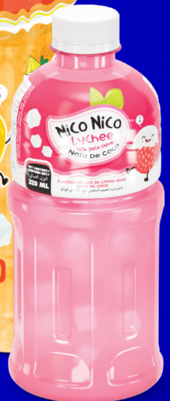
Juice with Nata de coco PET 320ML