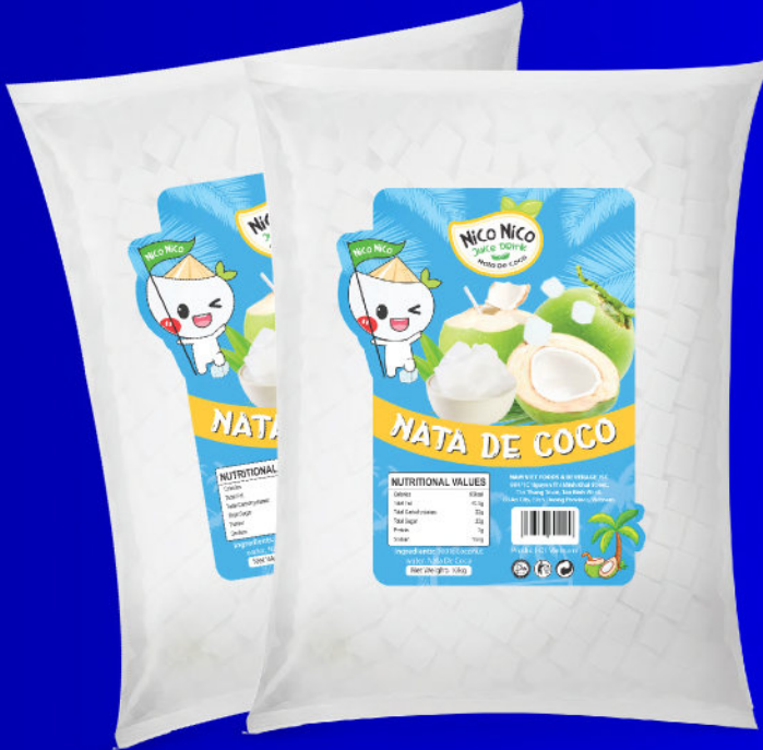
Nata de coco Jelly PLASTIC BAG 10KG