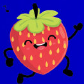
Popping boba PLASTIC BOX 3.2KG