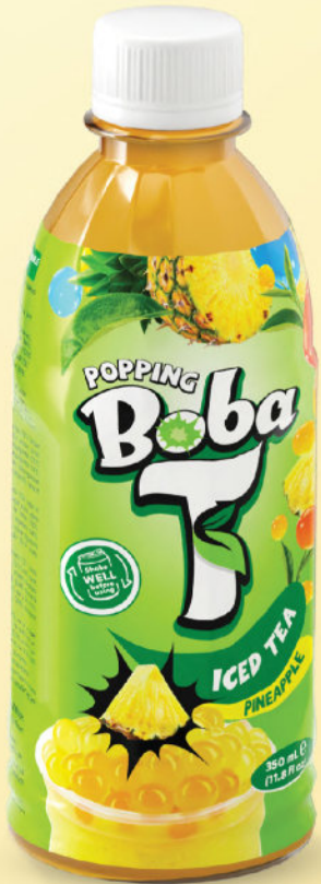
Boba popping Ice tea PET 350ML