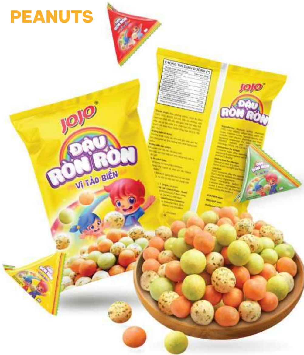
Ron Ron Peanuts – Seaweed Flavour 13g/bag; 20 bags/medium bag; 15 medium bags/ big bag Dimension (L x W x H) 30 (13x13) x 83 cm