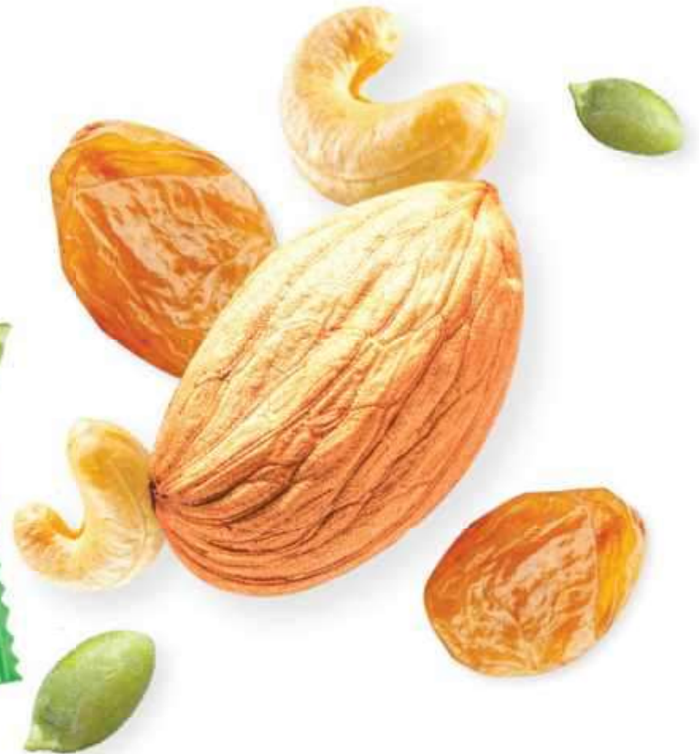
Nuts And Raisin