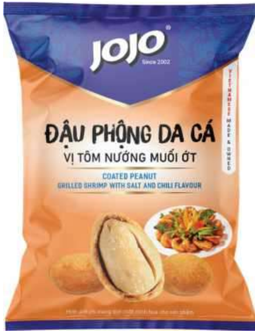
Coated Peanut Grilled Shrimp With Salt And Chili Flavour