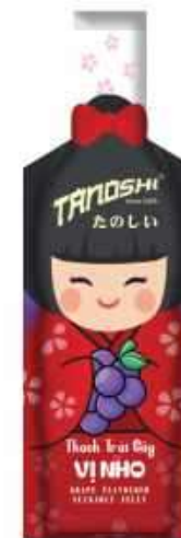
Grape Flavoured Suckable Jelly