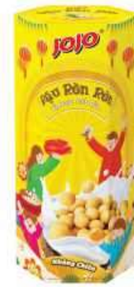
Ron Ron Peanuts – Coconut Milk Flavour 120g/bag; 24 boxes/carton Dimension (L x W x H) 440 x 365 x 228 mm