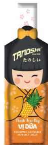
Pineapple Flavoured Suckable Jelly

Dimension (L x W x H): 440 x 300 x 185 mm