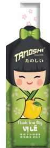
Pear Flavoured Suckable Jelly