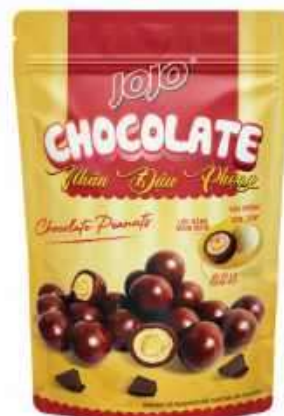
Chocolate Peanuts 35g/bags; 60 bags/carton ----- Dimension (L x W x H) 420 x 220 x 215 mm