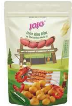
Ron Ron Peanuts – Grilled Shrimp And Chilli Salt Flavour 70g/bag; 30 bags/carton Dimension (L x W x H) 470 x 215 x 187 mm