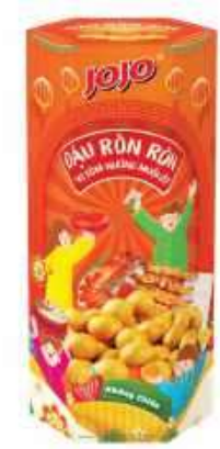
Ron Ron Peanuts – Grilled Shrimp And Chilli Salt Flavour 120g/bag; 24 boxes/carton Dimension (L x W x H) 440 x 365 x 228 mm