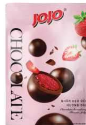
Chocolate Strawberry Flavoured Jelly 35g/bags; 60 bags/carton ----- Dimension (L x W x H) 420 x 220 x 215 mm