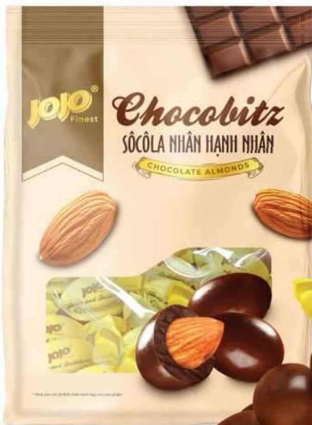
Chocobitz Chocolate Almonds