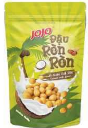
Ron Ron Peanuts – Coconut Milk Flavour 70g/bag; 30 bags/carton Dimension (L x W x H) 470 x 215 x 187 mm