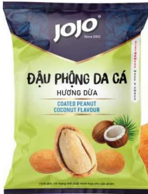
Coated Peanut Coconut Flavour

Dimension (L x W x H) 425 x 257 x 468 mm